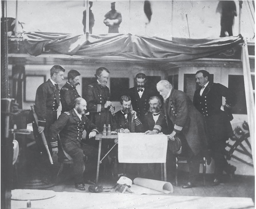
Rear Admiral John Rodgers confers with other officers on board the USS Colorado during the American expedition, June 1871