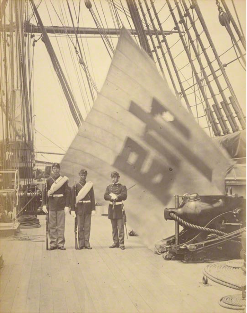
The Flag of the Commander in Chief of the Korean Forces, Felice Beato, June 1871.