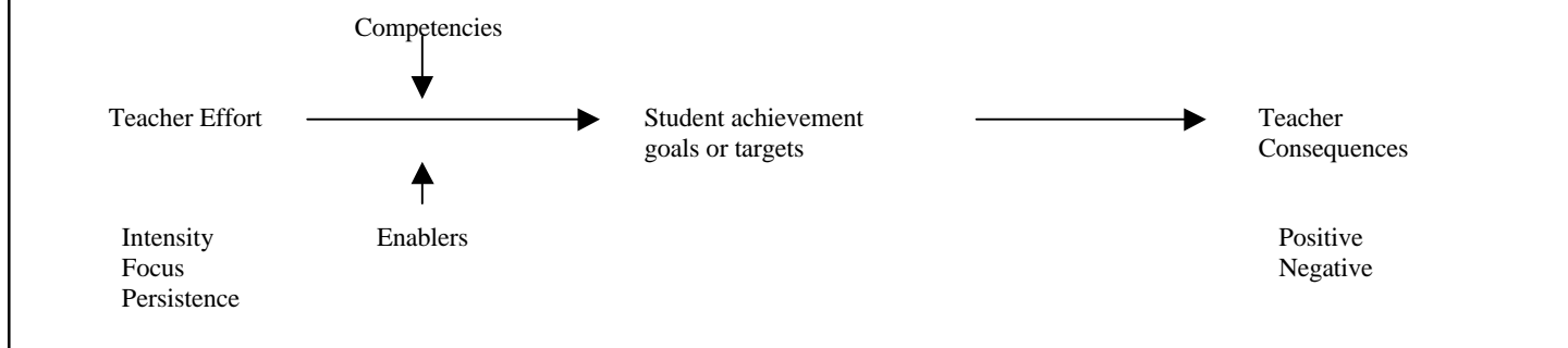
Figure 1 A Model of Teacher Motivation

Previous research calls attention to both “will” (motivation) and “skill” (capacity) as influences on improving schooling (e.g., McLaughlin, 1987). In our studies of the influence of accountability systems, we have been working with a model of motivation developed from Expectancy Theory (Vroom, 1964) and Goal-Setting Theory (Locke and Latham, 1990) (see Figure 1). The model suggests that a teacher will be motivated to try to reach the school’s student achievement goals to the extent that she (a) perceives a high probability that teacher effort will lead to students’ reaching achievement goals (expectancy perception); (b) perceives a high probability that goal attainment will lead to certain consequences or outcomes such as a bonus award (instrumentality perception); and (c) places value, either positive or negative, on these outcomes.