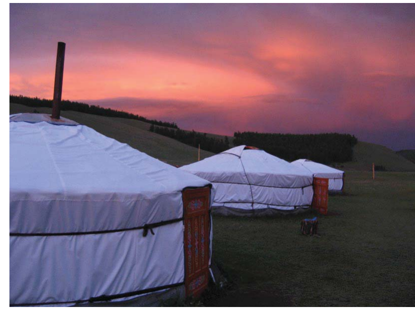
Mongolian Twilight Jenna Stahl ('11

The attitudes and intentions toward breastfeeding are the result of a complex interaction of factors such as exposure in public or at home, perceived knowledge about breastfeeding, and accessibility of information regarding breastfeeding. This study shows that at the college level, the majority of women have good knowledge regarding breastfeeding practices. Attitudes and intentions toward breastfeeding are formed independently and are not correlated to whether one was breastfeed as a child. Cultural differences impact the decision to breastfeed as well. Therefore, people from collectivist countries are more likely to initiate breastfeeding as compared to those from individualist countries.