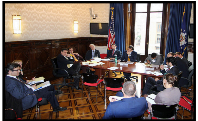
Participants discuss think tank solutions during a break-out session.