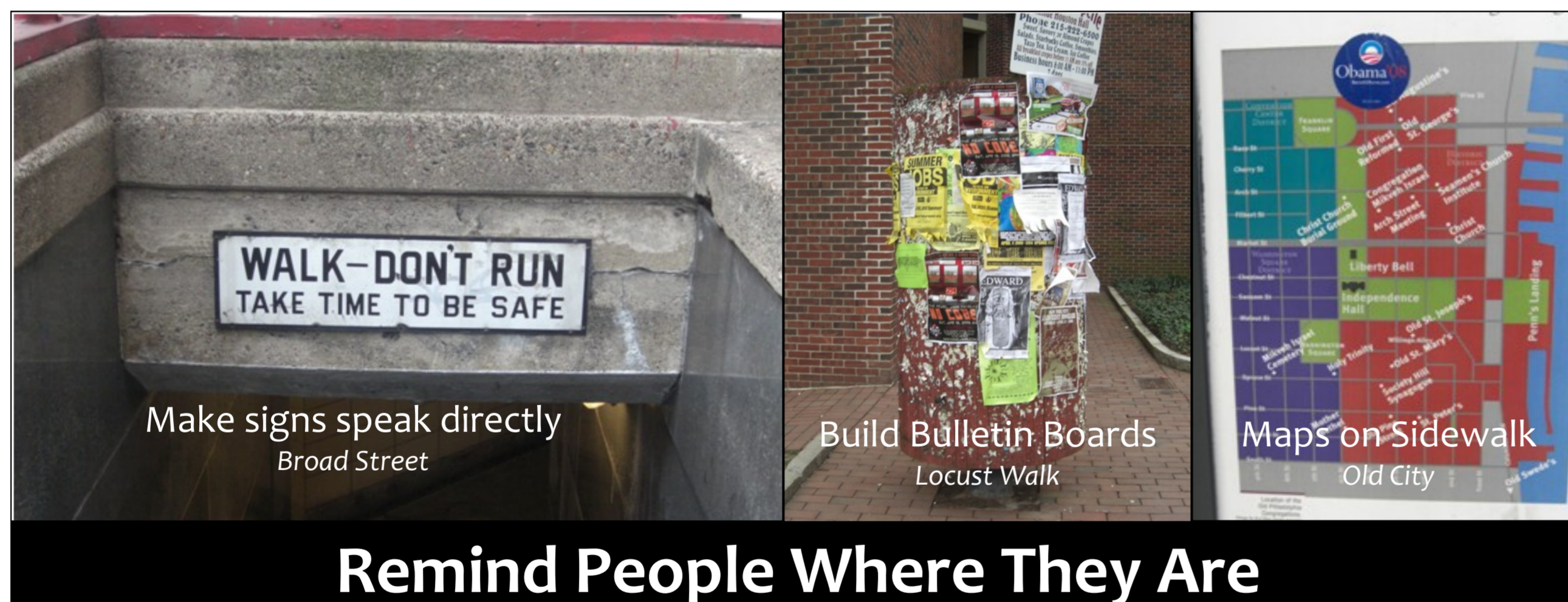
Remind People Where They Are