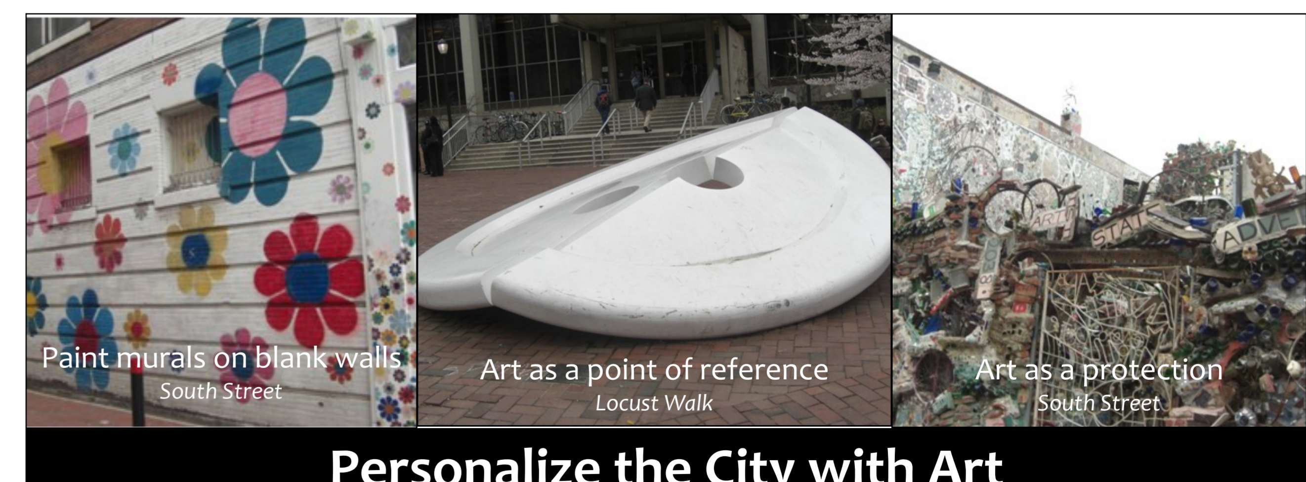
Personalize the City with Art

Lauren Priori URBS 205 April 10, 2008 City Comforts