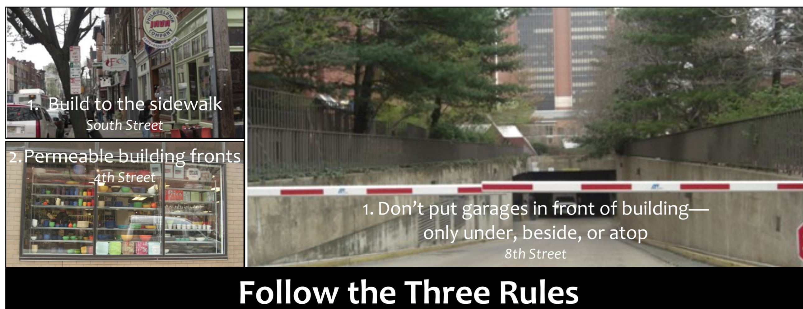
Follow the Three Rules