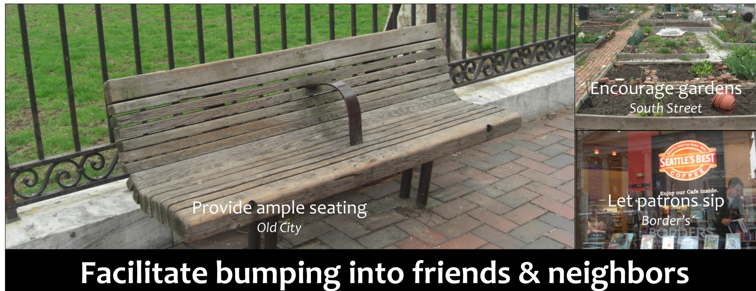
Facilitate bumping into friends & neighbors