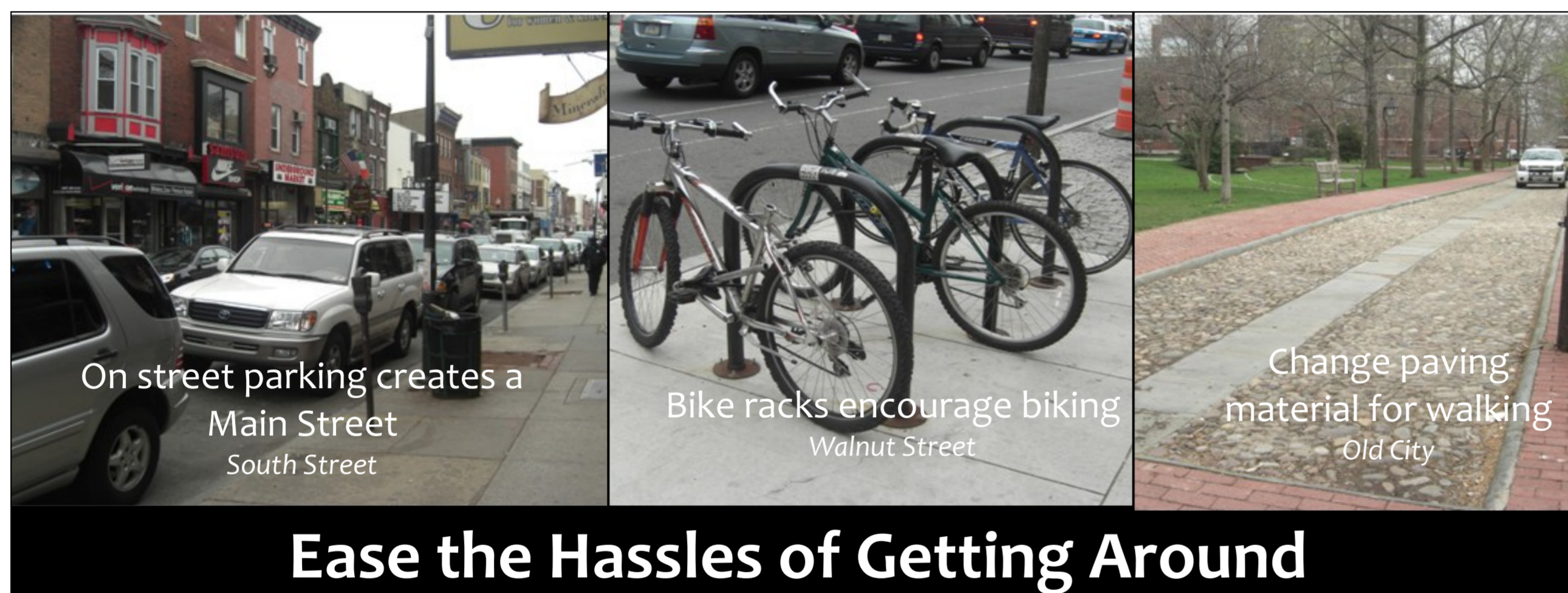
Ease the Hassles of Getting Around