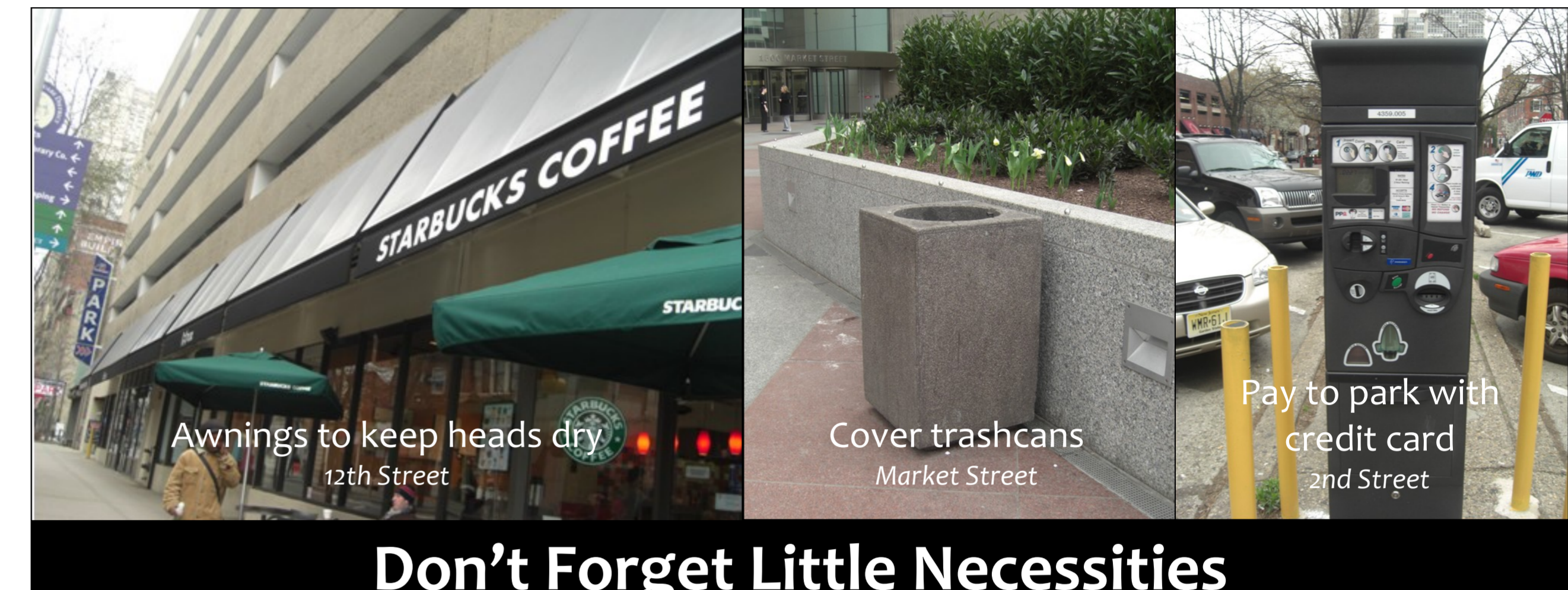
Don't Forget Little Necessities