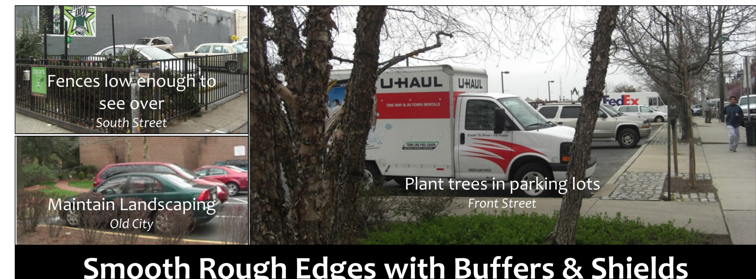
Smooth Rough Edges with Buffers & Shields