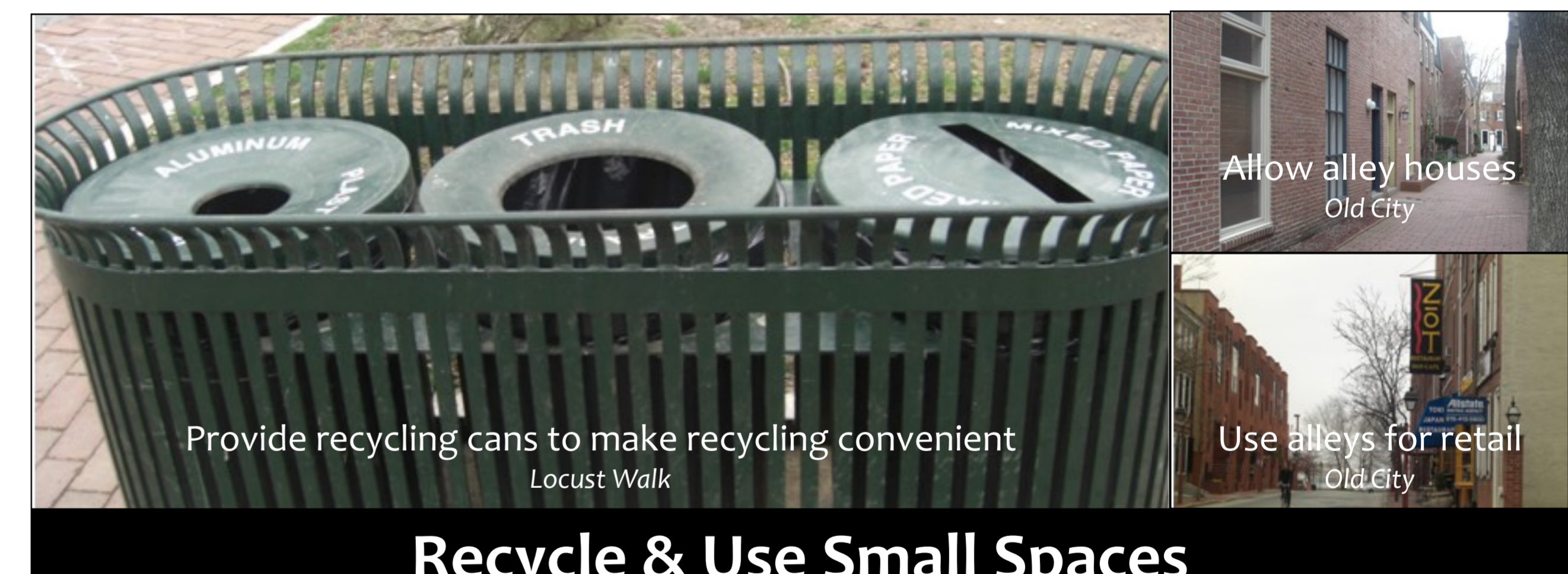
Recycle & Use Small Spaces