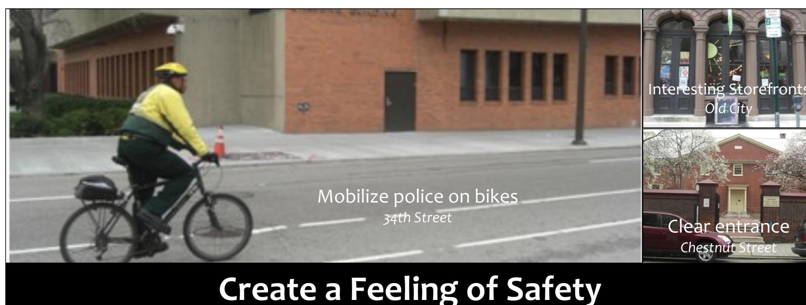
Create a Feeling of Safety