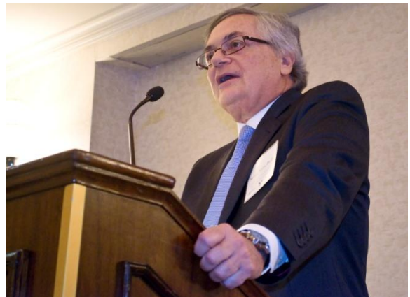
Moisés Naím, senior associate in the International Economics Program at the Carnegie Endowment for International Peace, delivers the keynote address

Governments don't have all the answers. Indeed, it was governments who failed to anticipate the economic collapse of 2008, and it is governments who today have failed to solve the Eurozone crisis. Where, then, will we find the answers? Think tanks aspire to fill this resulting void. It was in this spirit and context that over forty think tank (TT) directors, presidents, and senior fellows convened for the inaugural G20 Foreign Policy Think Tanks Summit in Philadelphia on the campus of the University of Pennsylvania. 1 The conference was groundbreaking in its scope and depth—TTs from every G20 country were invited; many of these countries were represented by multiple organizations. Across six sessions, four roundtable discussions, and two days, participants aimed to better understand the changing role of think tanks in a group of states with growing relevance in international affairs. Participants parlayed a variety of special, substantive foreign policy challenges such as Responsibility to Protect (R2P) and humanitarian and security crises in Africa and the Middle East. The conference also dealt with organizational matters ranging from the institutional intricacies of TTs around the globe to the role of TTs in the G20 and beyond.