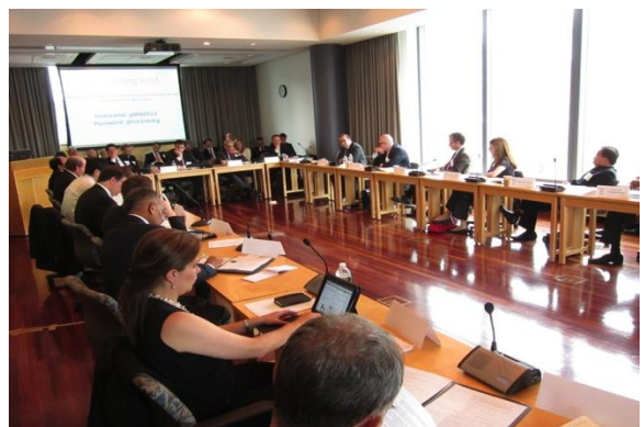
Participants share thoughts in a roundtable discussion

The 21 st century's 24/7 news cycle poses a unique problem for TTs. Not only is the rate of change increasing, but the heightened role of old and new media also increases our awareness of that change. Accordingly, donors and governments demand answers from TTs faster than ever. The concern is, however, that a shorter timeframe for research will be associated with a decline in the overall quality of the research. While TTs understand that their research depends upon funding from donors, it is imperative that they are able to communicate to their donors the importance of adequate degrees of freedom in setting research priorities and the time required to conduct in-depth, evidence based research. The goal is twofold: to have the necessary bridge funding so think tanks can conduct research on issues that require attention but have not come into focus for policymakers and donors; and to provide sufficient core funding to enable TTs to conduct research on emerging and enduring policy issues.