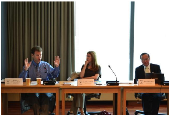
Michael O'Hanlon, senior fellow at the Brookings Institution, engages the participants during a panel session

The rapid expansion of transnational issues forces contemporary TTs to no longer view their research from a singular, national lens. They need to not only look at issues of national concern, but also those that impact the greater world, such as proliferation of weapons of mass destruction, implications of climate change and R2P. As one participant put it, "The days of armchair analysis are over. Scholars must be in country and on-the-ground in order to provide meaningful analysis." Others suggested that in order to be