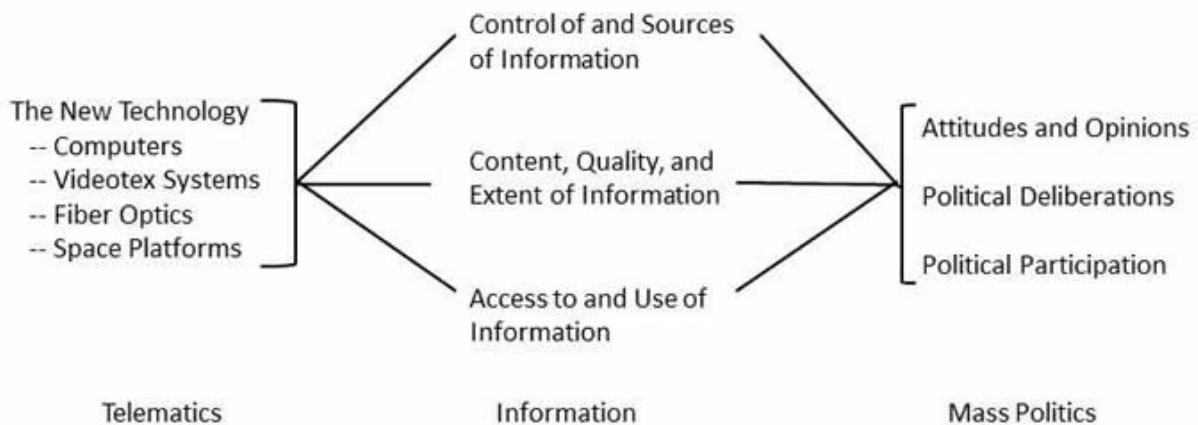
Figure 1. A conceptual framework to study relations among telematics, information, and mass politics.

Central to the democratic political process is the availability of information for citizens to use in evaluating the world in which they live and in acting upon those evaluations. At the heart of the recent advancements in telematics is the availability of more information, the availability of information in less time than ever before, and the availability of information directly into the homes of a large and growing sector of the population. While much of this information is largely entertainment oriented, some is not. The availability of 24-hour news from either cable stations, satellite news stations, or directly from wire services is one example. The electronic transmission of newspapers, journals, and books is another. Databank services such as COMPUSERVE provide instant access to thousands of different information sources on topics ranging from adult education to job openings to world news. As advanced societies move from an industrial base to a more mixed, service based economy, information becomes a critical currency which rivals capital and labor in its importance. 14 The information explosion, of which telematics is a critical part, is both a cause and a result of this new balance of power.