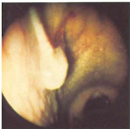
Fig 3. Diagnosis of empyema of the guttural pouch can frequently be confirmed by endoscopic evidence of drainage from the pharyngeal orifice. The pouch distended with pus protrudes into pharynx.

Treatment consists of daily irrigation through a Neilson or Guenther catheter or