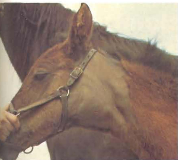
Fig 1. The most characteristic feature of tympanitis of the guttural pouch is the air-filled distention in the region of the throat latch posterior to the ramus of the mandible.

problem, calling for a guarded prognosis, and the possibility of fatal epistaxis should be reported to the owner. No truly effective treatment is available at this time, but the disease is undergoing extensive study.