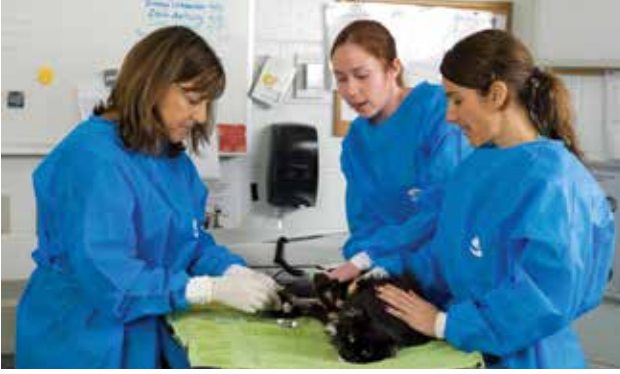
Oncology nurses administer a round of chemotherapy to a feline patient.