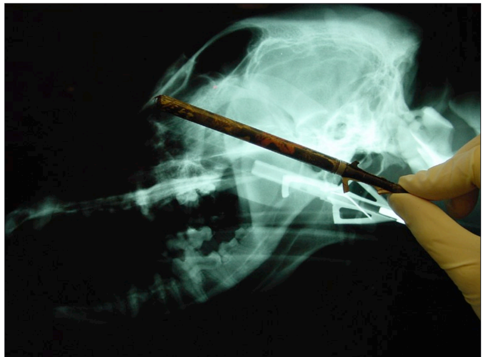
Broken arrow held up to x-ray after being removed from Alice.