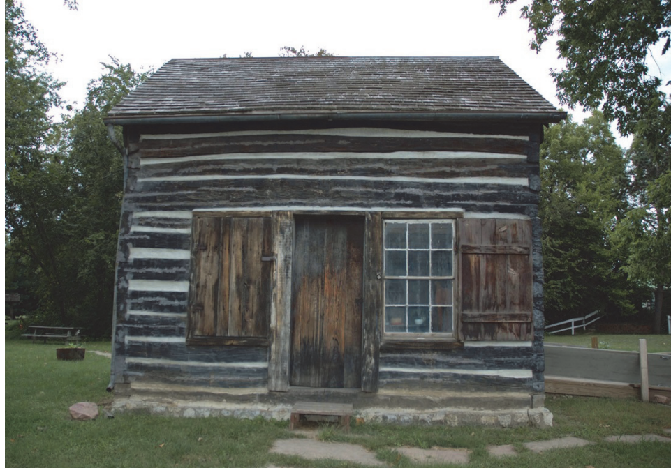
Figure 2: Mayhew Cabin restored to its 1855 period of significance.