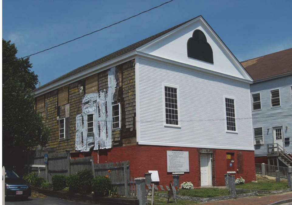
Figure 1: Pictured in 2013 with the façade restored, The Abyssinian Meeting House was listed on the National Trust for Historic Preservation’s annual “Most Endangered List” because of lack of funding to restore the rest of the structure (visible on the side.)