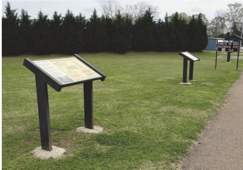
Figure 3: Pictured in 2013, the city-owned parcel of the Forks of the Road site features no original structure but does contain interpretive texts and a historical site marker featuring the National Underground Railroad Network to Freedom logo.

communication of its history.” There are now 1,000 copies remaining. 114