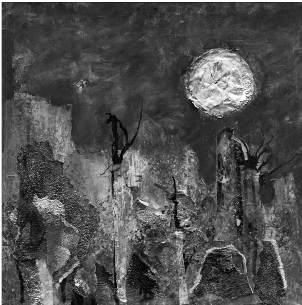
Forsythe, K. (2008). City . 60 cm x 60 cm, acrylic on canvas with encaustic.