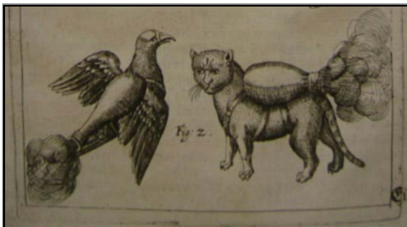
– Armamentarium principale oder Kriegsmunition und Artillerie-Buch (Frankfurt a.M., 1625), p.48