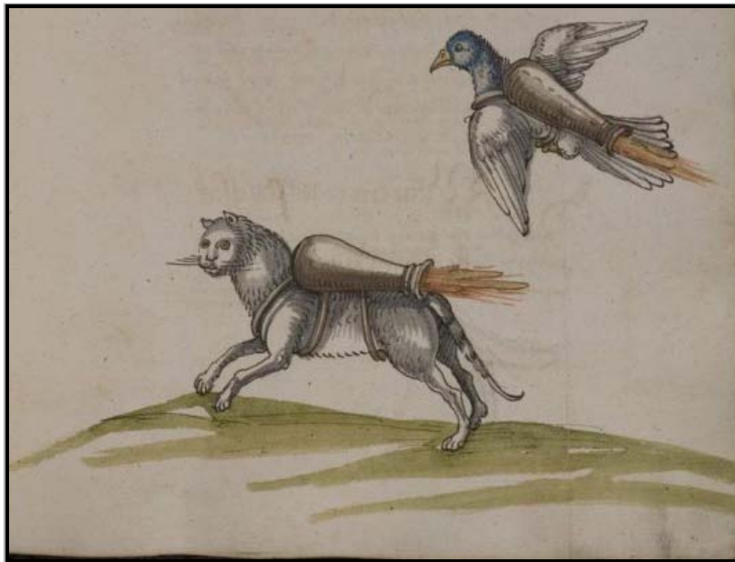
– Universitätsbibliothek Heidelberg, Cod. Pal. germ. 128, f.74r

Heidelberg has cataloged their manuscript as the “Buch von den probierten Künsten” of Franz Helm. Though drawing on the Feuerwerkbuch, this text dates from a century later (c. 1530) and includes large new sections on siege warfare and different types of explosive weapons. In fact, the Penn collection includes an identified copy of Helm’s treatise, though unillustrated (LJS 254). Thanks to a recent critical edition of the work I was able to confirm that the text of both LJS 442 and Codex 109 were indeed from the Buch von den probierten Künsten [3].