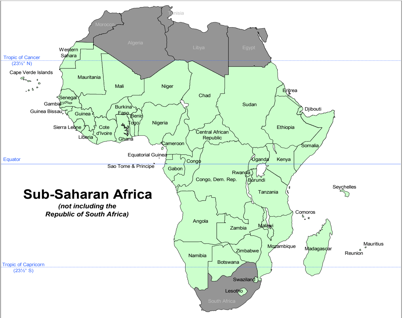
Figure 1. Map of Africa Sub-Saharan Africa is south of the Tropic of Cancer (23 1/2° N)