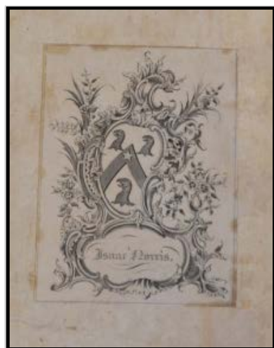
— Bookplate of Isaac Norris (1802-90) in the collected volume.

The other pamphlets in the assembled volume also relate to Whig political themes as well as political matters of interest to those involved in Caribbean trade [7]. Remarkably, one of these neighboring texts relating to Caribbean matters: A letter to a noble peer, relating to the bill in favour of the sugar planters [London?], 1733 survives only at Penn and at the John Carter Brown Library in Providence. The presence of both of these pamphlets together at Penn demonstrates the close ties between cities within the 18th c. Atlantic world as well as the ephemerality of a lot of the early print production of these imperial centers.