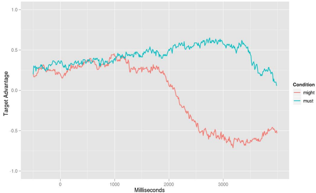
Figure2: Target advantage (must- might) starting from 500ms prior to modal onset until 2 seconds after column onset: around 1000ms after the modal onset there is a clear divergence between the must and the might conditions.

The ambiguity period was defined as starting from the modal onset (“must” or “might”), and until 200ms after the onset of the row locator. Figure 3 shows the target advantage for this period, for items for which the guess made was matching in the might condition (half of the items). 4