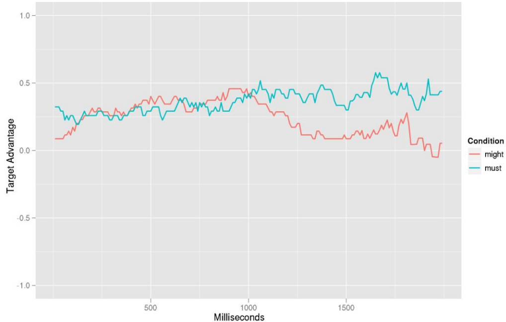
Figure 3: Target advantage ( must- might ) starting at the modal onset and until 200 milliseconds after the onset of ‘row’ for items with matching guess.

Starting from 1000ms after modal onset the must and might conditions diverge, as the target advantage score for the might condition lowers. Before that, the target advantage score for both conditions is (equally) high, meaning that participants looked more at the shape that could be guessed with certainty for both conditions. Thus, subjects initially looked at the target (the shape that could be guessed with certainty) more than they looked at the competitor (the shape that could not be guessed with certainty). Upon hearing “must” subjects kept looking at the target, and 1000ms after hearing “might” looks to the competitor increased relative to looks to the target. If we take the display in Figure 1 as an example, this would mean that subjects initially looked more at the target (the shape in the upper right, which could be guessed with certainty). When the confederate uttered “ There must be a red square located in the upper right ”, upon hearing “must”, participants kept looking more at the target; when the confederate uttered “ There might be a red square located in the bottom left ”, 1000ms after the onset of “might” participants started looking more at the competitor (the shape in the bottom left, which could not be guessed with certainty).