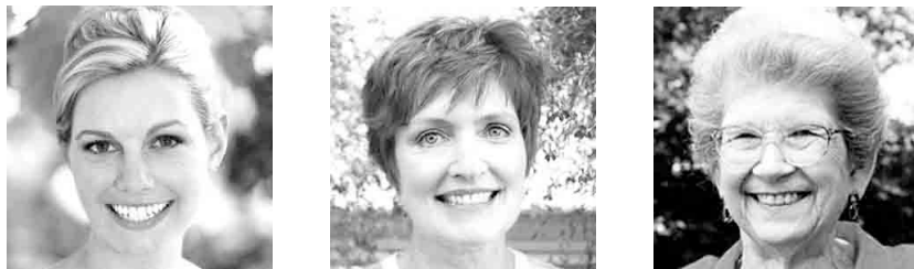
Figure 2: The three different Anglo females varying by age paired with the auditory stimuli

To manipulate perceived speaker age we adopted Hay et al.'s (2006) matched guise design, but with an expanded age spectrum. The auditory stimuli were presented in the guise of three Anglo females of different ages by displaying to the participants one of three photographs (Figure 2).