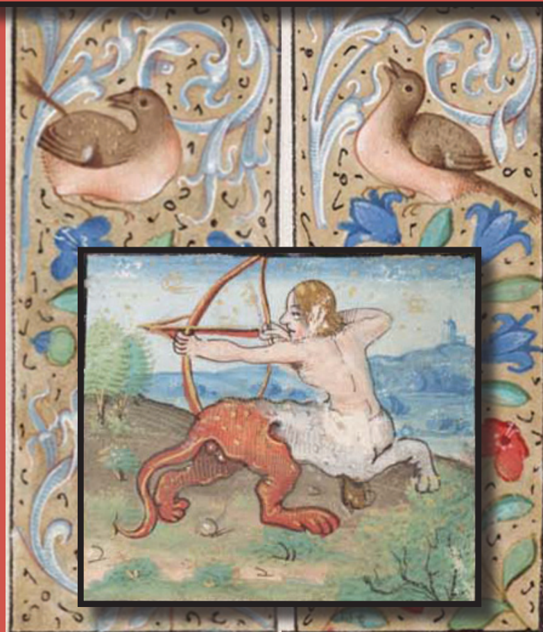
Sagittarius, from a Book of Hours, Lewis E 125, fol. 5r.

University of Pennsylvania, Rare Book & Manuscript Library, Van Pelt-Dietrich Library Center, 6th floor