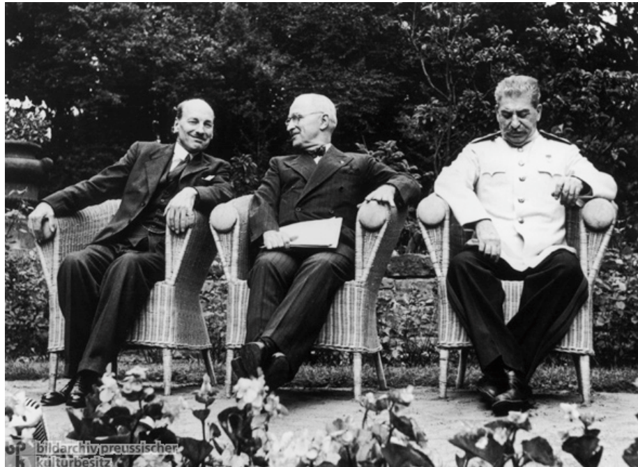
The Potsdam Conference was held between July 17 and August 2, 1945. Here (from left to right) British Prime Minister Clement Attlee, United States President Harry Truman, and leader of the Soviet Union, Josef Stalin.