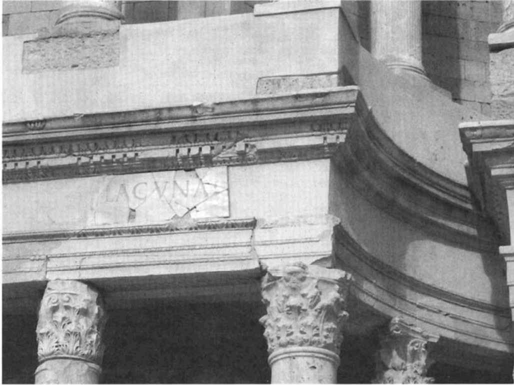
1. The paradox of loss and its visual and structural compensation.