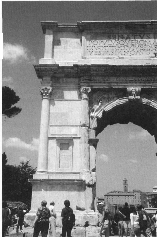
2. Arch of Titus with Valadier's reintegration of simplified travertine forms.

the word inserted, itself dependent on a range of contextual clues based on the structure of the existing text (for example, spacing and meter) as well as other comparable versions. In this regard, modern conservation theory follows philological methods in that any insertion is clearly differentiated from the original, thus preserving the integrity of the original text and the possibilities for alternative interpretations now and in the future (that is, reversibility or retreatability). One significant difference is the importance of the visual appearance of the insertion in affecting the aesthetic value and formal meaning of the work. As one early example of this approach to reconcile aesthetic and historical interpretation, Brandi cited the 1823 intervention to the Arch of Titus by Gisor and Valadier. 10 (Figure 2)