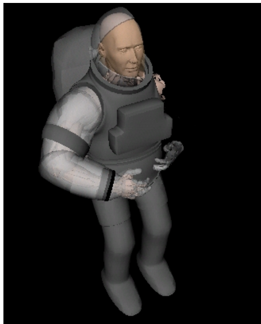
Figure 3. Astronaut & EMU geometry by Tietronix Software Inc.

This research is largely composed of two parts. The first part is modeling a deformable human arm based on these empirical biomechanical properties and calculating the deformation due to various contact areas. The second part is evaluating the reachable space (reachability) from the arm deformation in a given geometric (CAD) environment. Using the empirical force-displacement relation we have built a simple human arm model that deforms using a finite element method. We are now working on a human within an EMU model with more detailed geometry provided by Tietronix Software (Figure 3).