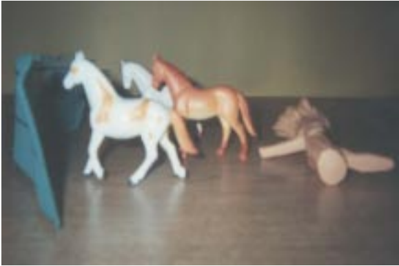
The horses are about to jump over the fence