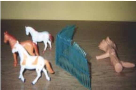
Some of the horses jumped over the fence