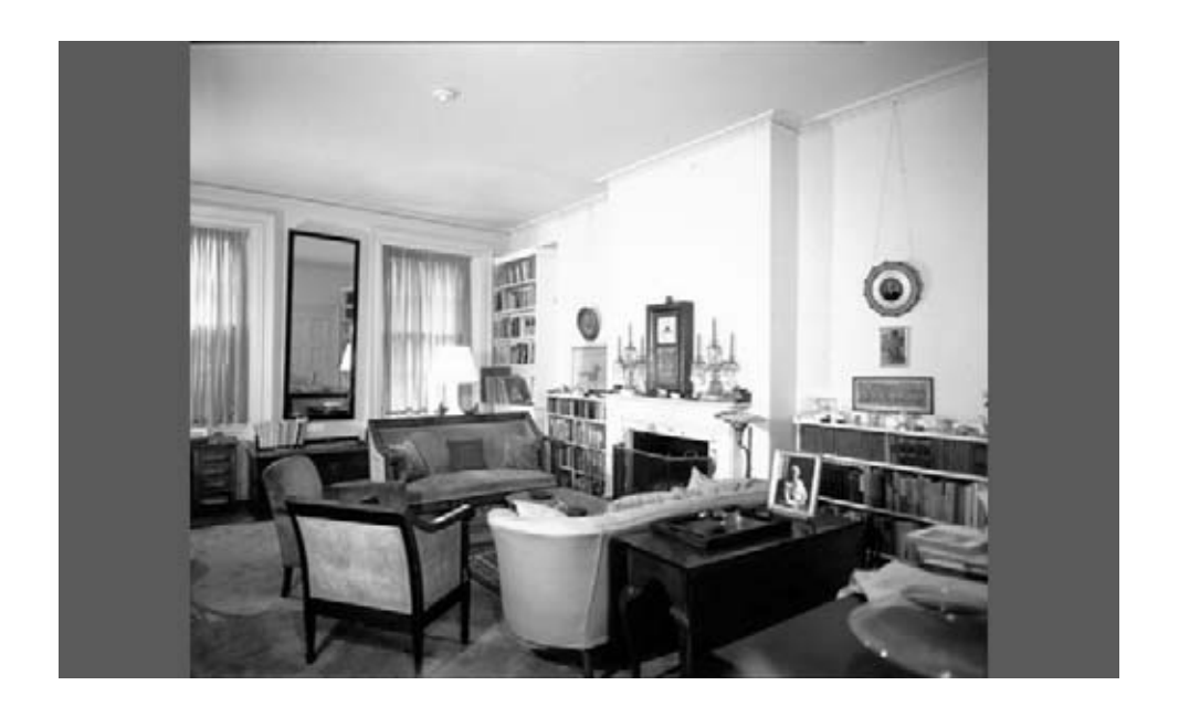
Figure 6: Installation of Marianne Moore Room's Greenwich Village Living Room in the Rosenbach Museum, n.d.