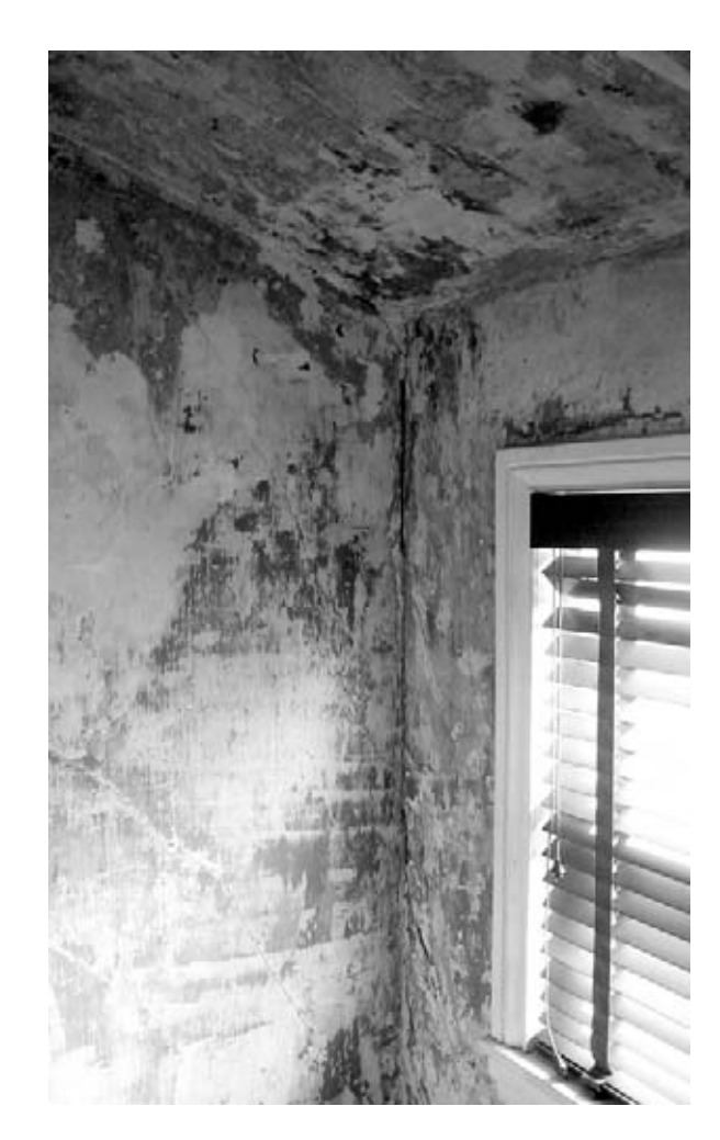
Figure 4 and 5: Interior Views of the Poe House, 2004.