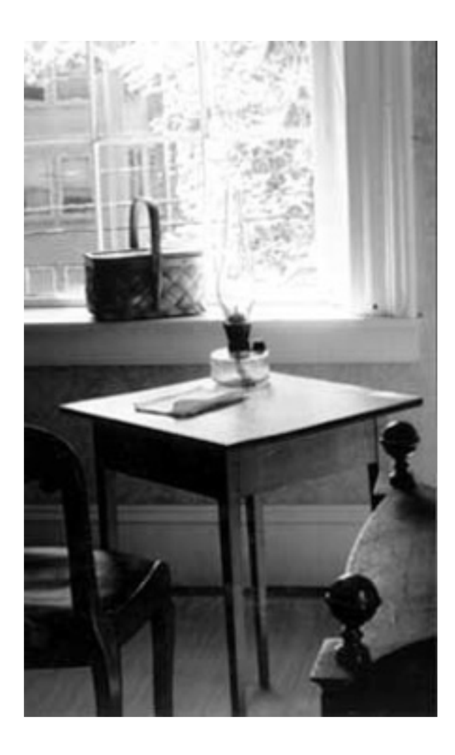
Figure 1: Emily Dickinson's desk in her bedroom in the Dickinson Homestead, n.d.