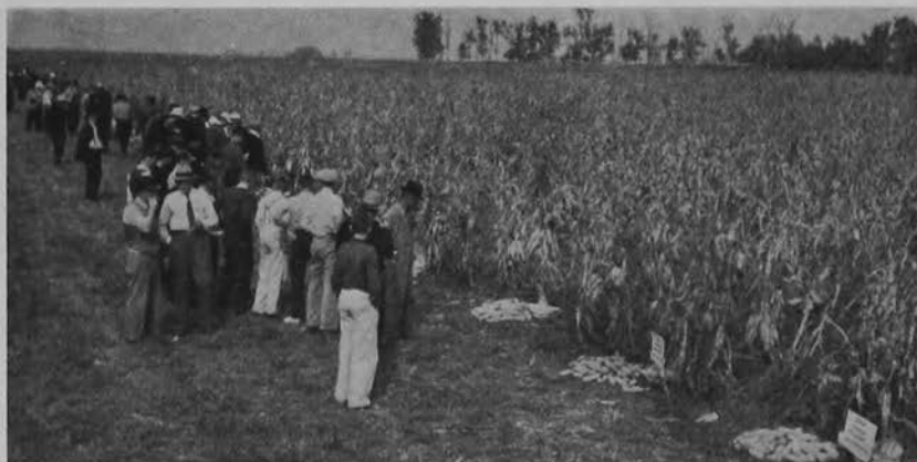
Hybrid Corn Field Meeting, Cottonwood County, September 30, 1938