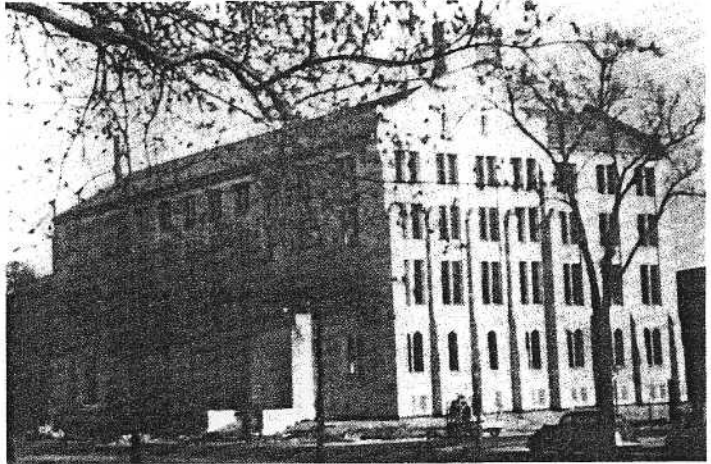
"1313"—ASPO's headquarters in Chicago