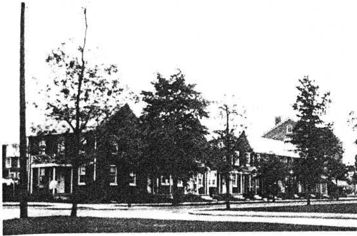
Yorkship Village—site of the 1918 ACPI field trip and meeting