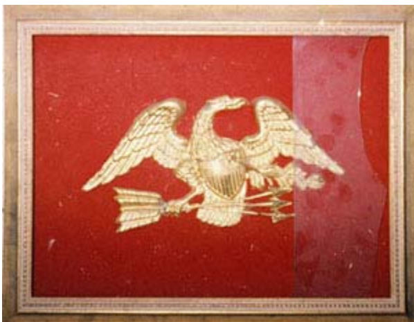
Fig. 5. Gold eagle, five by ten inches, framed with shard of broken glass, from private family collection.