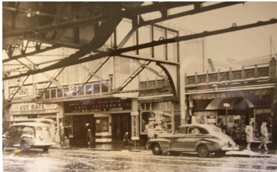
Figure 18. Forum/Ellis/Xtasy Theatre (circa 1945)