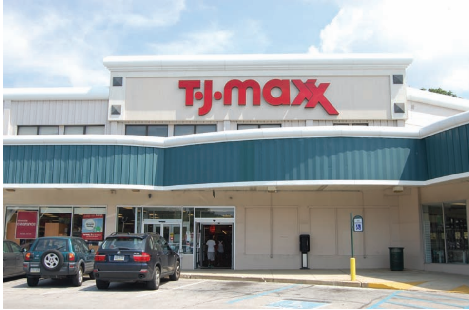
Figure 15. City Line Center Theatre William Harold Lee Original Architect (circa 1930s) Source: Glazer, 86. 7600 City Avenue, Philadelphia Photo by Author