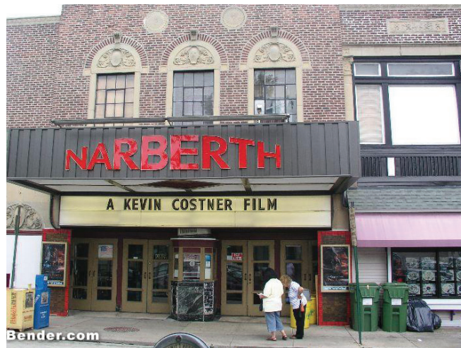
Figure 8. Narberth Theatre (Prior to 2004 Renovations)