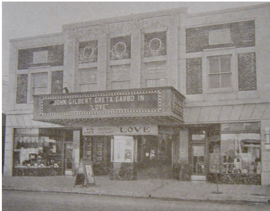
Figure 4. Bryn Mawr Film Institute/Seville Theatre (circa 1927)