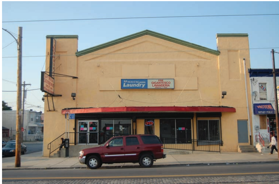
Figure 14. Century Theatre William Harold Lee—Restoration/Renovation (1927); Additions/Alternations (1938) Erie Avenue and Marshall Street, Philadelphia