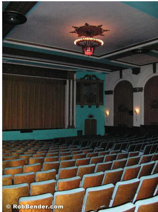
Figure 9. Narberth Theatre Auditorium (Prior to 2004 Renovations)