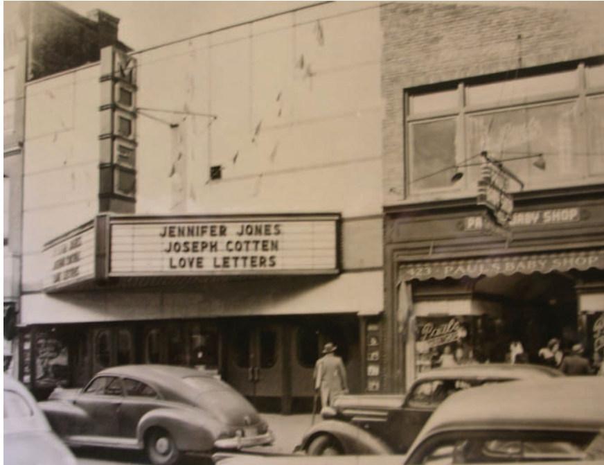
Figure 33. Model Theatre