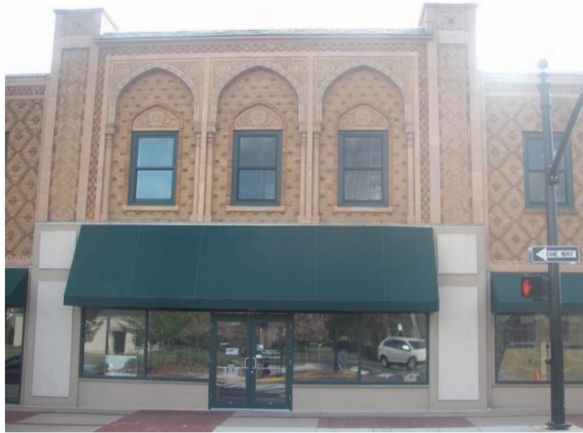
Figure 19. Grand Theatre William Harold Lee Original Architect (circa 1928) 422 Mill Street, Bristol