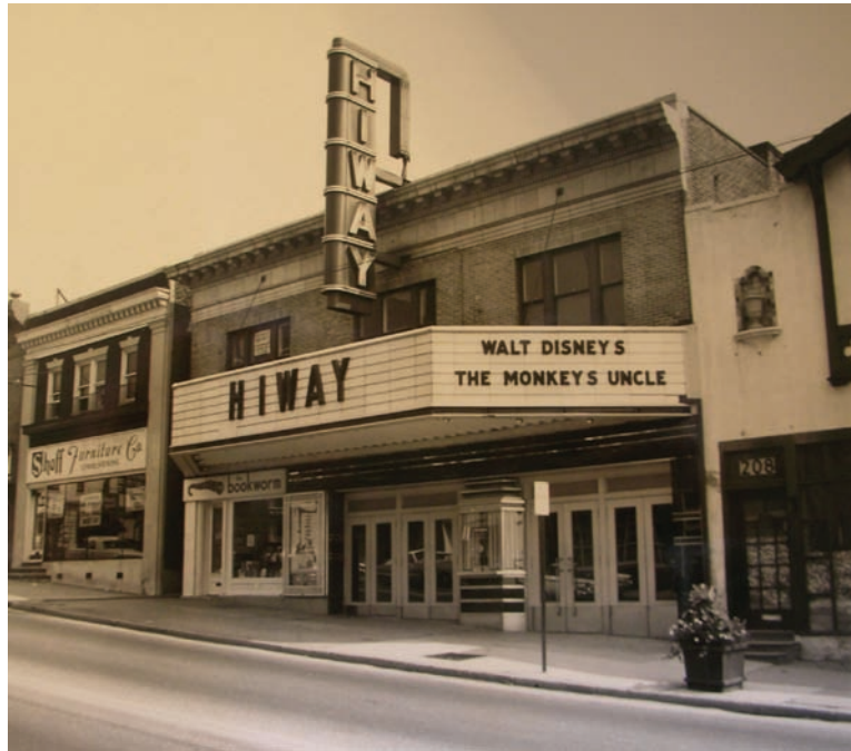
Figure 6. Hiway Theatre (1965)