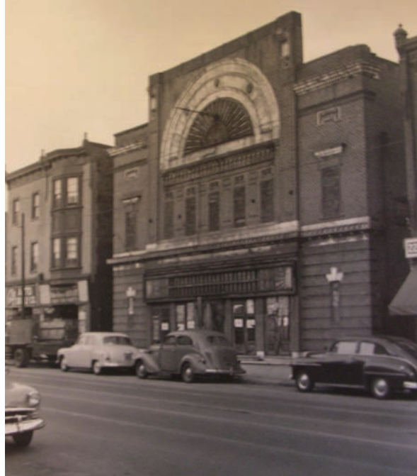
Figure 27. Jefferson Theatre