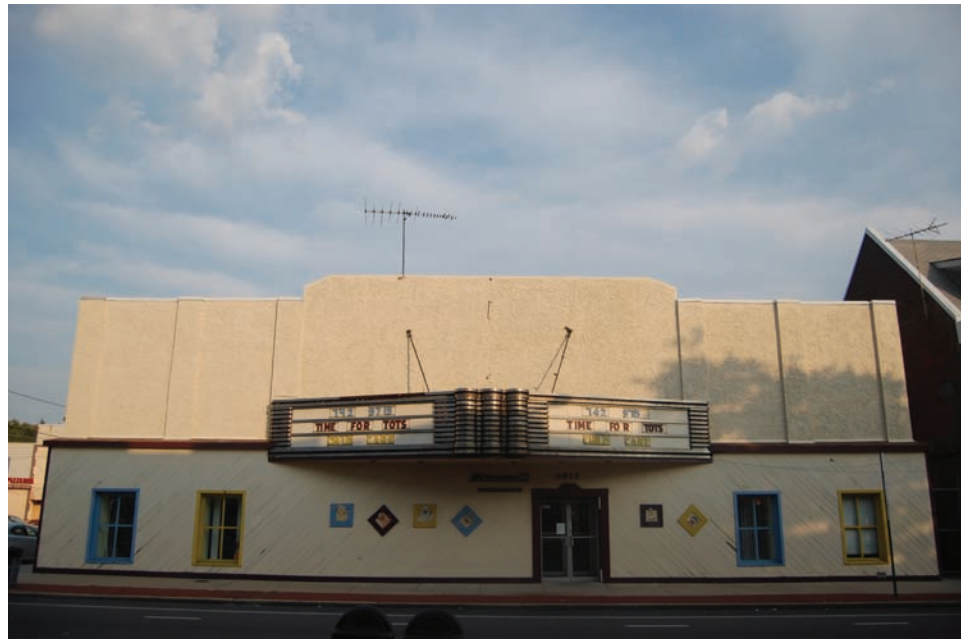
Figure 28. Lawndale Theatre William Harold Lee—Additions/Alternations (1937) Source: Glazer, 149; PAB Rising Sun Avenue and Fanshawe Street, Philadelphia Photo by Author