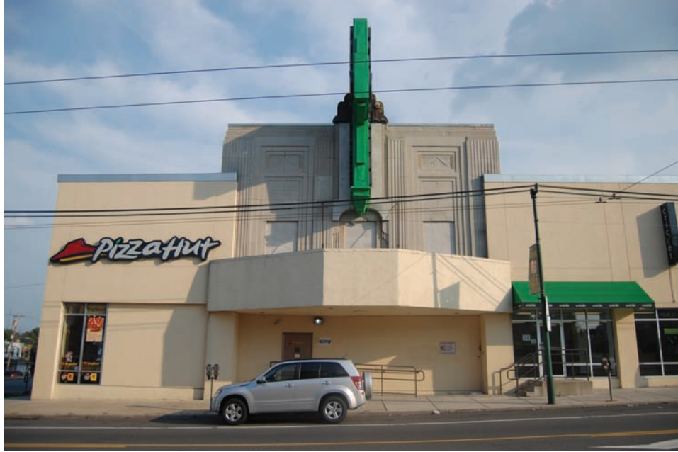
Figure 25. Holme/Penypak Theatre William Harold Lee Original Architect (1929) Source: Glazer, 136; PAB 8049 Frankford Avenue, Philadelphia Photo by Author