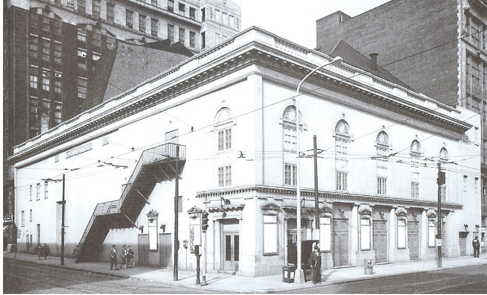
Figure 11. Walnut Street Theatre (1952)