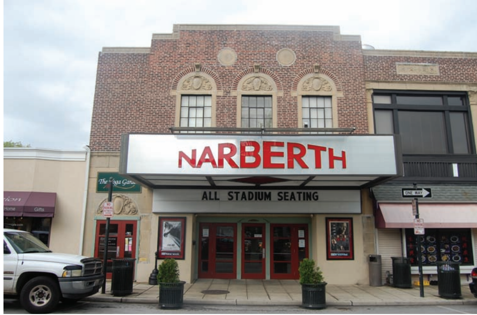
Figure 7. Narberth Theatre (After 2004 Renovations) Possible Original Architects: Jacob Ethan Fieldstein/William Harold Lee (1927) Source: Cinema Treasures—NT 129 N. Narberth Avenue, Narberth Photo by Author