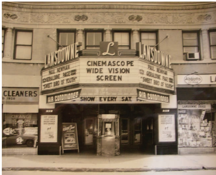
Figure 42. Lansdowne Theatre (1962)