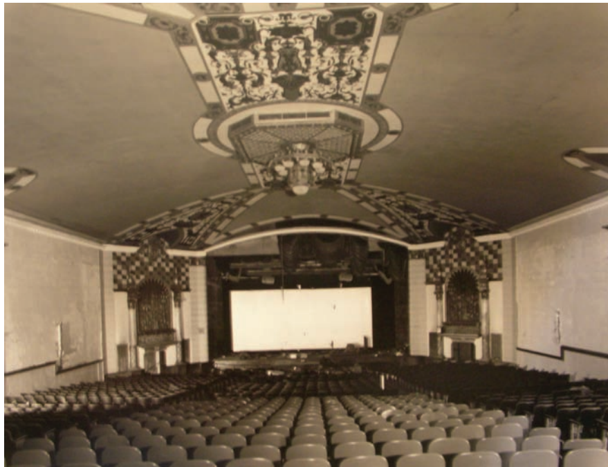
Figure 44. Lansdowne Theatre Auditorium