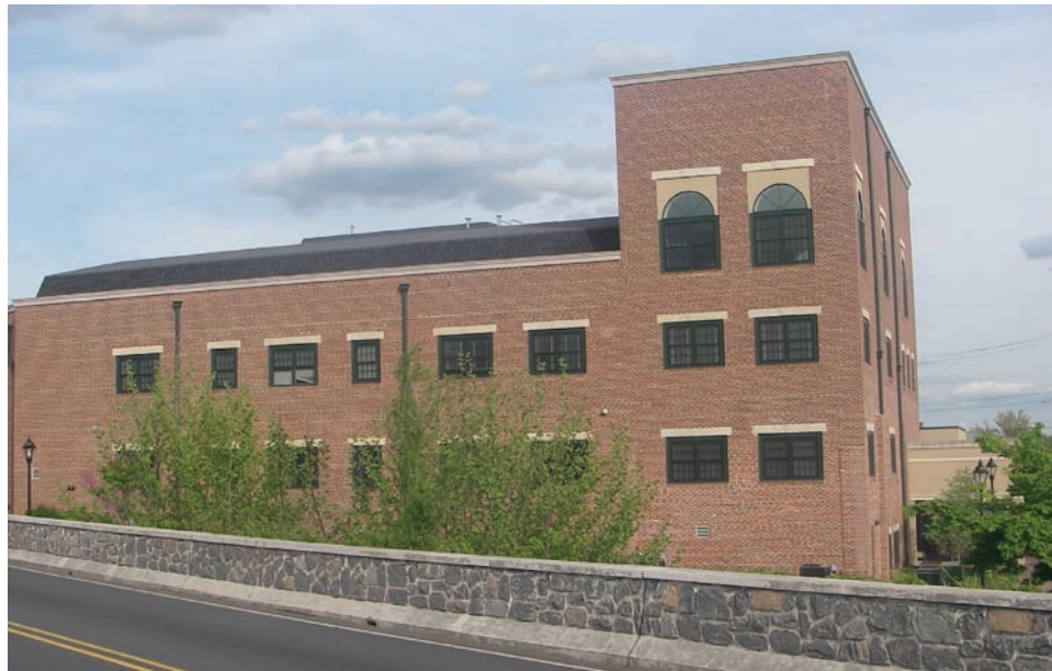
Figure 20. Grand Theatre Auditorium Converted into Housing