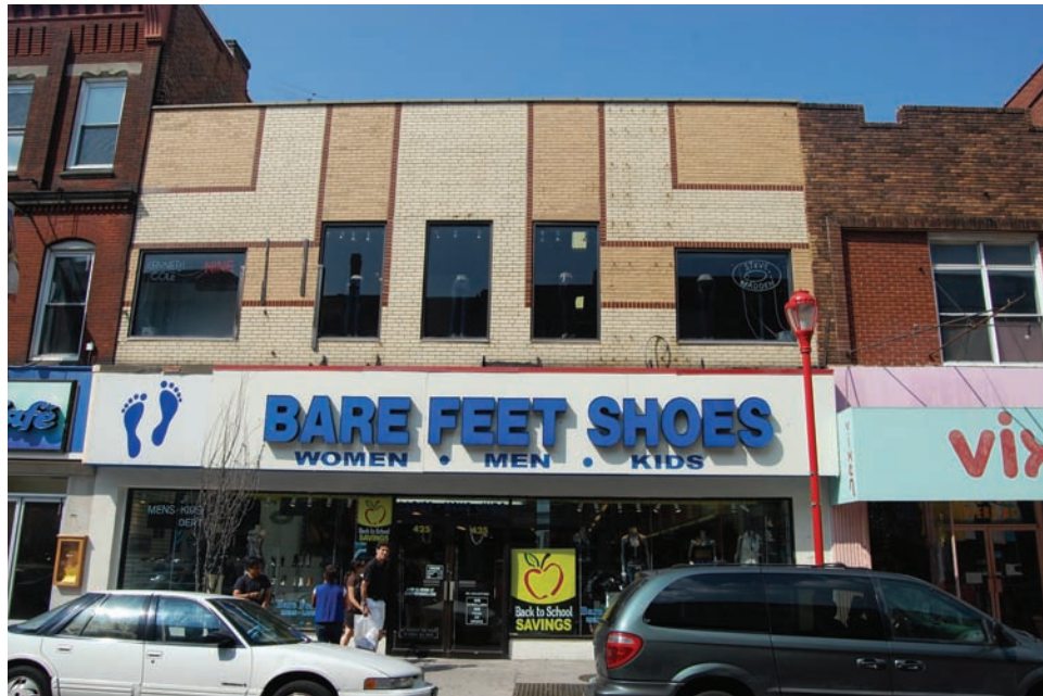
Figure 32. Model Theatre William Harold Lee—Additions/Alternations (1930) Source: Glazer, 171; PAB 425 South Street, Philadelphia Photo by Author