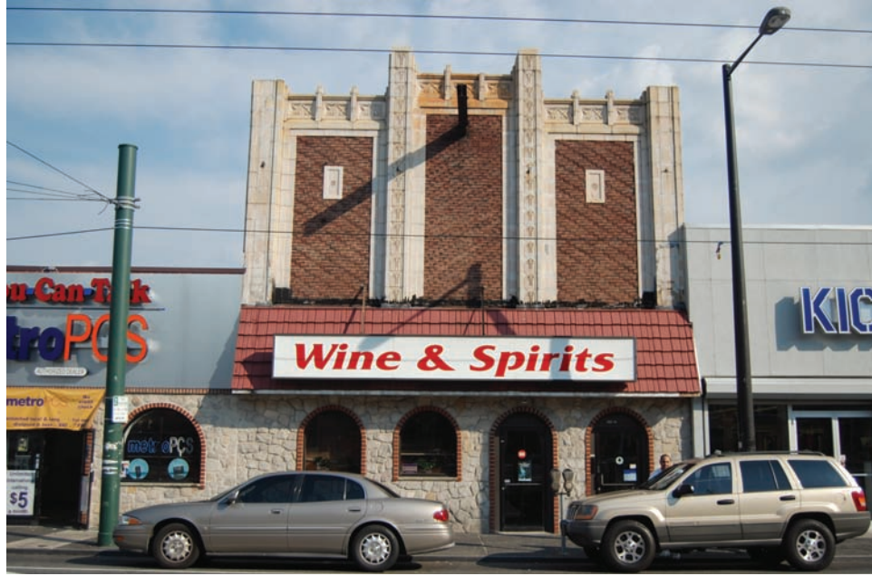
Figure 17. Forum/Ellis/Xtasy Theatre William Harold Lee Original Architect (1928) Source: Glazer, 116-117; PAB 5231 Frankford Avenue, Philadelphia Photo by Author