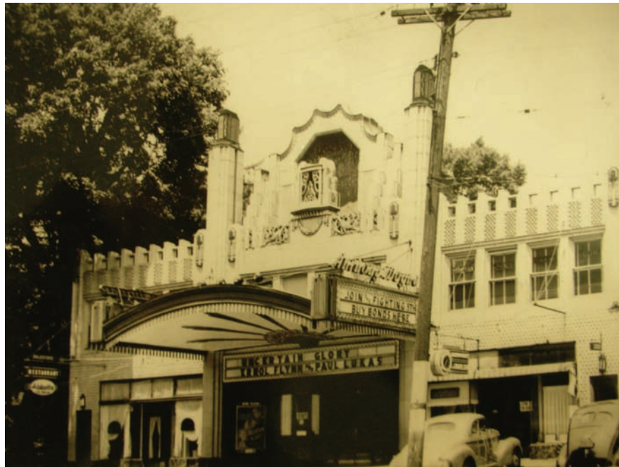
Figure 2. Anthony Wayne Theatre