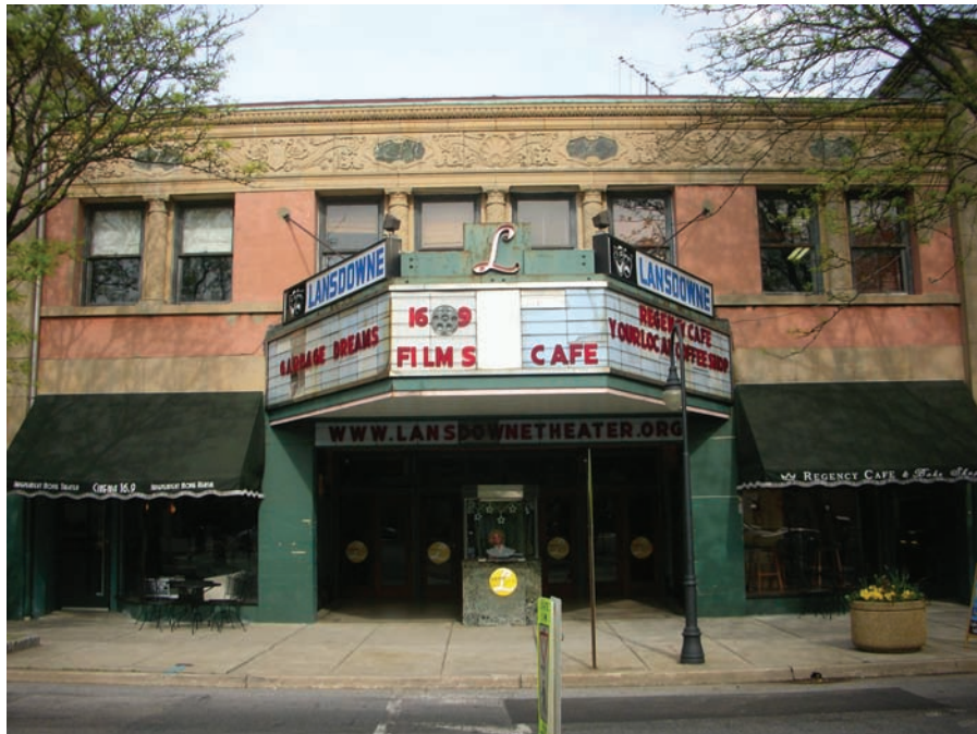
Figure 41. Lansdowne Theatre Close-Up