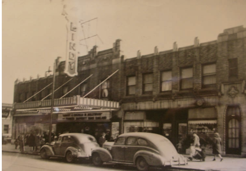
Figure 31. Lindy Theatre (circa 1945)