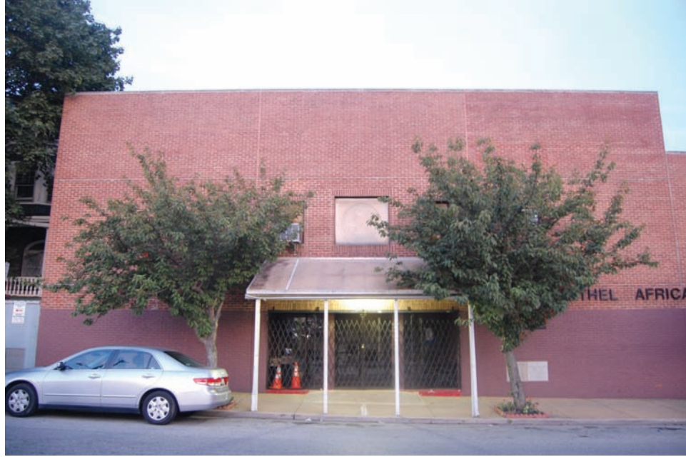
Figure 35. Rialto Theatre William Harold Lee—Additions/Alternations (1931) Source: Glazer, 197; PAB 6153 Germantown Avenue, Philadelphia Photo by Author