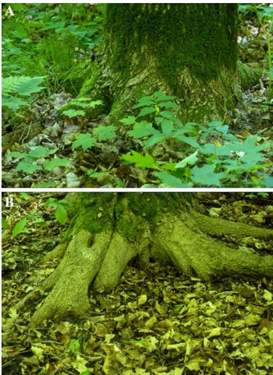
Fig. 2 Forest floor and plant community at base of trees before (a) and after (b) European earthworm invasion in a sugar maple-dominated forest on the Chippewa National Forest, Minnesota, USA.

The rate and magnitude of the removal of the forest floor and the consequences for native forest plant communities depends on the species of earthworms invading (Hale et al. 2005b). The strictly epigeic species, D. octaedra , has a limited effect on forest floor thickness and does not lead to increased plant mortality (Gundale 2002).