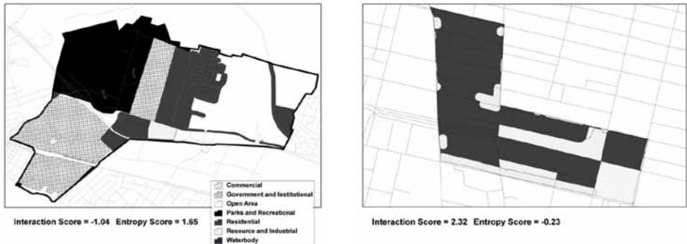
Figure 4 Close-ups of two census tracts showing methodological discrepancies

area. In this manner, a census tract with residential and commercial uses adjoining one another will score higher than one with these land uses being distant.