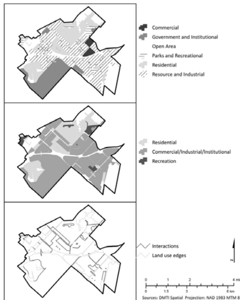
Figure 2 Interaction method procedure

In order to preserve continuity with the theory behind land use mix and only compare measures that differ in method, three categories were defined from the land use dataset. The underlying assumption of this research is that shorter travel distances—allowing active transportation choices—can be generated by the mixing of complementary land uses. In order to operationalize this for this study, we have divided the seven land uses into three categories. Residential was left as its own category; commercial, institutional and governmental, and resource and industrial were collapsed into a second category to represent commercial and employment destinations within each census tract; and park and recreational was collapsed with water into a third category to represent opportunities for leisure