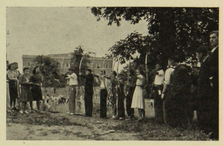
Groups enjoy a wide variety of recreation and social features

Special parties and socials. These usually will be scheduled as "extra" or "between meetings" events rather than as substitutes for the monthly meeting. Only a few possibilities are suggested here.