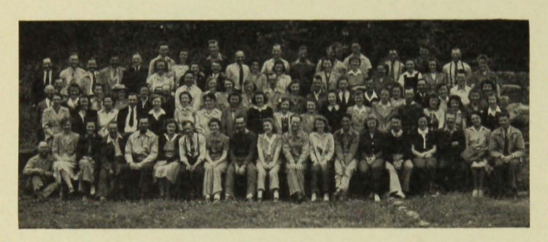
Delegates at Rural Youth camp, Medicine Lake, June, 1942