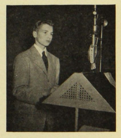
District winner in 4-H and Rural Youth radio public speaking contest

Special references, record forms, and contest rules and ideas are available at county extension offices for each of these projects. Other projects and contests are announced from time to time state-wide in the Rural Youth Rouser, quarterly newsletter published at University Farm and sent to each officer.