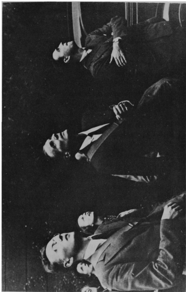
September 1st. Watching the first large-scale air raid over Warsaw from the courtyard of the Chancery.