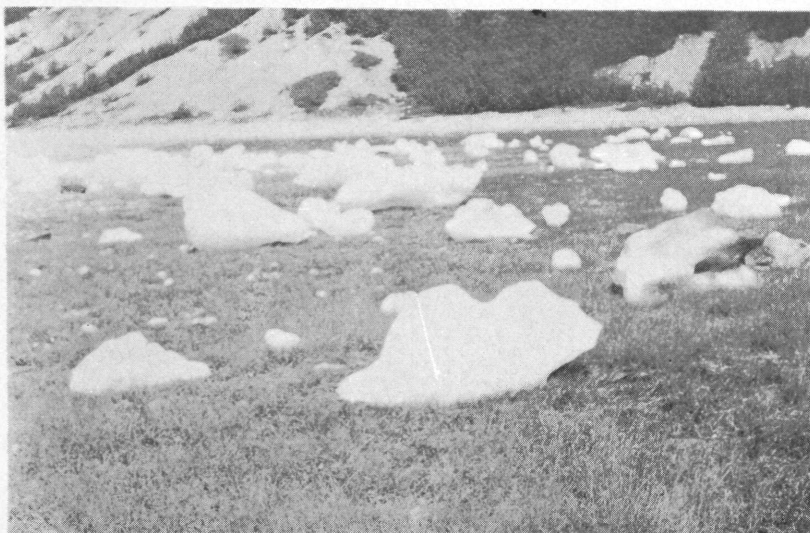
FIGURE 2. Tidal flat showing dense growth of Puccinellia nutkaënsis (Presl) Fern & Weath. with icebergs left by a receding tide.

The following day this area was revisited just before the predicted time of the high tide submergence and a number of white cloths were spread upon the grass surrounding several clumps of grass which contained rather heavy populations of leafhoppers. During careful observations made from stations in the water, no leafhoppers appeared to leave these plants as they were submerged. In addition, vigorous collecting on all the vegetation surrounding the tidal flat during the period of submergence produced no specimens of these leafhoppers. At the time of tidal recession, we walked out to the submerged plants, remained until the water had receded and immediately collected active leafhoppers from the grass. Similar observations were made at Bartlett Cove, Alaska, some 50 kilometers south of Muir Inlet, but there no icebergs were present in the water.