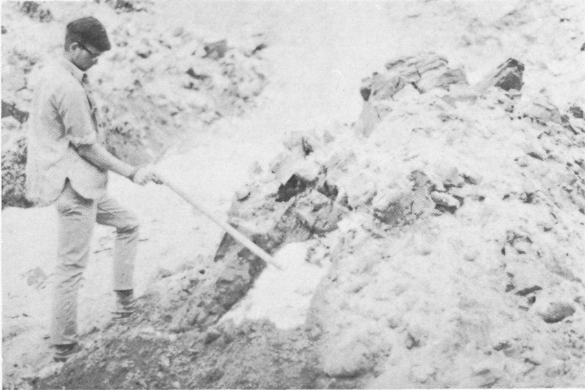
FIGURE 2. Hummock of blocky sand over snow. In 50 days this kame had collapsed to a slight depression.

ments using thermistors in the sand of one of the snow-bank kames. A YSI Tele-thermometer readable to \pm 0.2^\circ\text{C} and accurate to \pm 0.5^\circ\text{C} was used. The thermistors of the Tele-thermometer were placed at depths of 3, 10, 20, 41, and 53 cm, the lowest being at the sand-snow interface. Readings were made every hour on the hour for a 27-hour period on June 23-24, 1967. The range of the