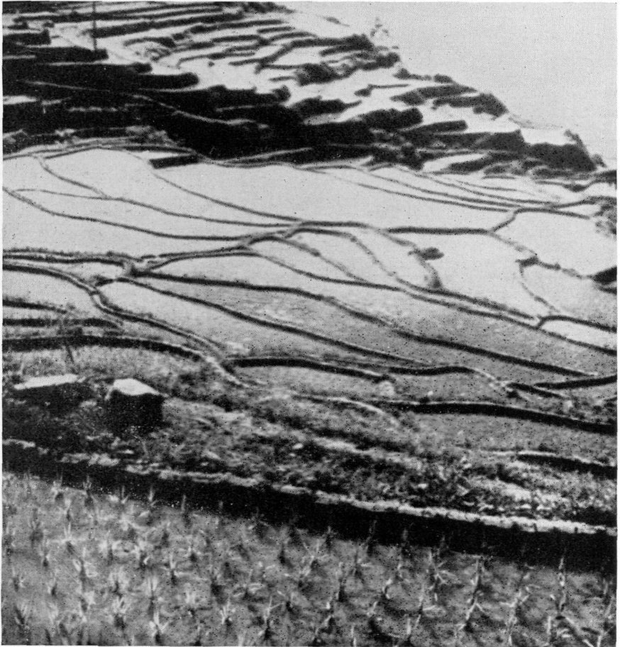
FIG. 2. All suitable land is being utilized by the Japanese.

Japan's shipping and fishing industries developed in its protected waters in primitive times. It was a safe avenue for the interisland commerce that must have played an important part in unifying the nation before the beginning of written history. After the establishment of transpacific commerce in the second half of the last century it became even more important because it gave Japan a landlocked passage from Kobe, her greatest shipping port, and Osaka, her greatest industrial city, to the Yellow Sea and the Sea of Japan and the closest route to all the ports of north China, Manchuria, and southern Korea.