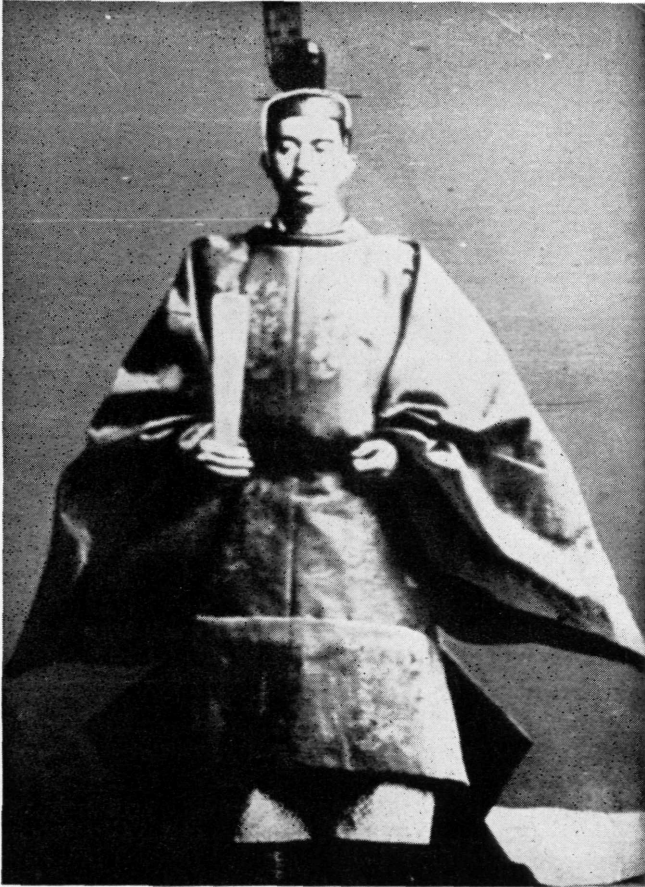
FIG. 4. Mikado Jimmu Tenno, God-Emperor, center of all Japanese philosophy and life.

In July, after receiving a letter from SCAP, in regard to the trade-union activities of public service employees, the Japanese Cabinet issued Order No. 201. This Order outlawed acts of dispute by public service workers; revoked the right to collective bargaining; abrogated existing collective bargaining agreements; and