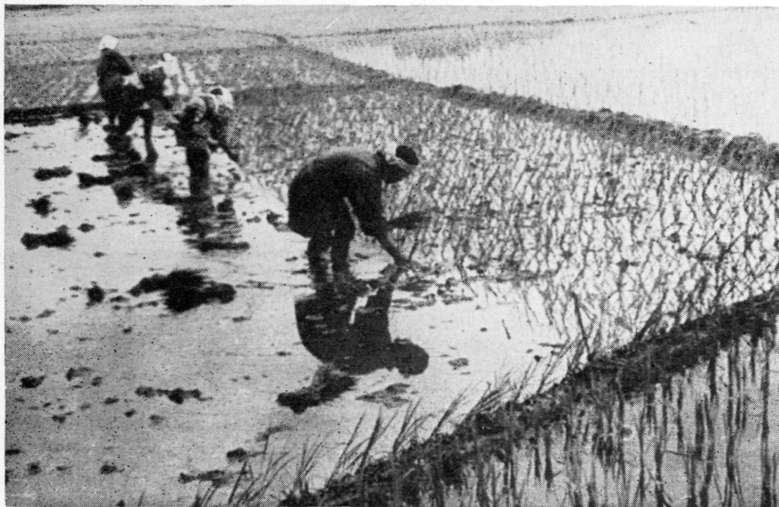
FIG. 3. Intensive agriculture is the main occupation in Japan.

It is important to emphasize that Japan's commercial potential has two obvious factors: 1. production and 2. the utilization of the Asia-North America trade routes. The removal of restrictions that hamper trade over these routes will mean that their use will be vastly increased. The Japanese ports will never