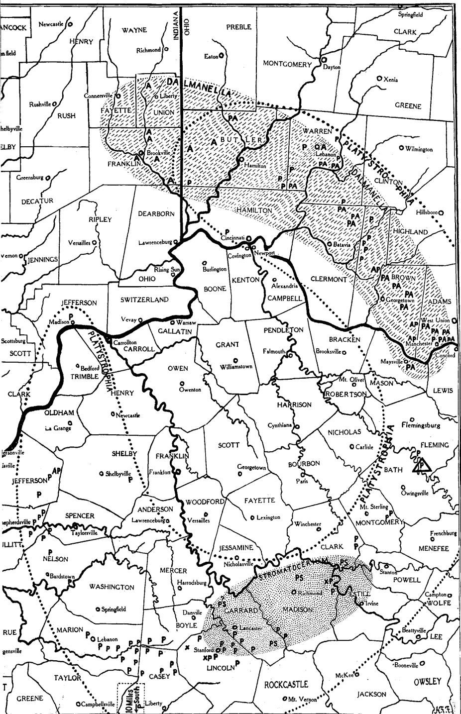
TRIBUTION OF PLATYSTROPHIA PONDEROSA, DALMANELLA JUGOSA, AND STROMATOCERIUM HURONENSE IN THE ARNHEIM. STROMATOCERIUM AT BASE OF MOUNT AUBURN.=Δ.