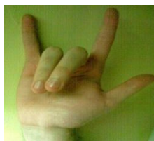
Picture 10. I love U

awareness, lecturers are suggested to give appealing and challenging activities in CCU class. For tertiary level students, besides poster presentations, role play can be an alternative way to apply since they can use their creativity and practice critical thinking to respond the gestures. In addition, to stimulate them in the beginning of the class, the use of pictures and reading texts are possible to do.