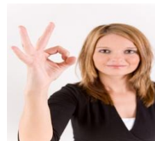
Picture 1. O.K