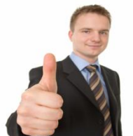
Picture 6. Well done