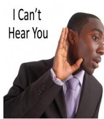
Picture 4. I can't hear you