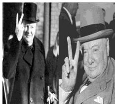
Picture 7. Peace Picture