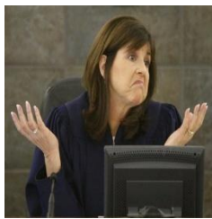
Picture 3. I don't know