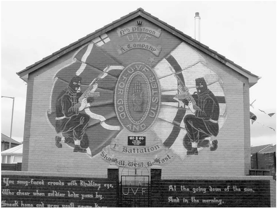
Figure 5.1. UVF mural in West Belfast, a typical paramilitary representation.

Rolston (1992) describes the expressive character of murals: “Through their murals both loyalists and republicans parade their ideologies publicly. The murals act, therefore, as a sort of barometer of political ideology. Not only do they articulate what republicanism or loyalism stands for in general, but, manifestly or otherwise, they reveal the current status of each of these political beliefs” (27). Murals exhibit political ideology, and in the case of Northern Ireland’s loyalists, the decline and resurgence of mural painting as well as its content have reflected the broad outlines of the unionist and loyalist psyche. This, incidentally, is not to say that all residents of loyalist neighborhoods appreciate or condone paramilitary activity or the murals that valorize them and mark territory. In fact, murals are often placed without the consent of local residents under an unspoken threat of intimidation that ensures paramilitary organizations can claim territory as they see fit through the placement of murals. Nonetheless, Neil Jarman argues that murals have not just reflected but have promoted solidarity in both loyalist and republican