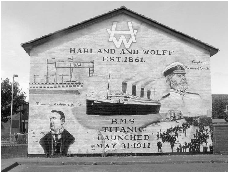
Figure 5.2. Titanic mural in downtown Belfast, a source of Protestant pride.

hoods in which the murals are painted (Jarman 2005). Indeed, several of these projects have gained significant media attention.