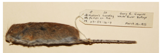
Figure 1. Southernmost specimen (UALR 236) of Reithrodontomys megalotis collected in the Mississippi Valley, obtained at Hudson Landing, Phillips County, Arkansas, on 14 March 1973.

The southernmost specimen from Arkansas (Fig. 1) was collected in Phillips County at Hudson Landing (34° 11.29' N; 91° 4.26' W) on the White River levee, about 200 m south of the pumping station on 14 March 1973 (UALR 236; ♂; collected by Gary R. Graves, catalog number 20), as compared to McDaniel et al (1978). This location lies 77 km southeast of the nearest collection site in Lee County. The trap was set in a Hispid Cotton Rat ( Sigmodon hispidus ) runway in a dense stand of grass and forbs at the edge of a blackberry ( Rubus sp.) thicket at the base of the levee.