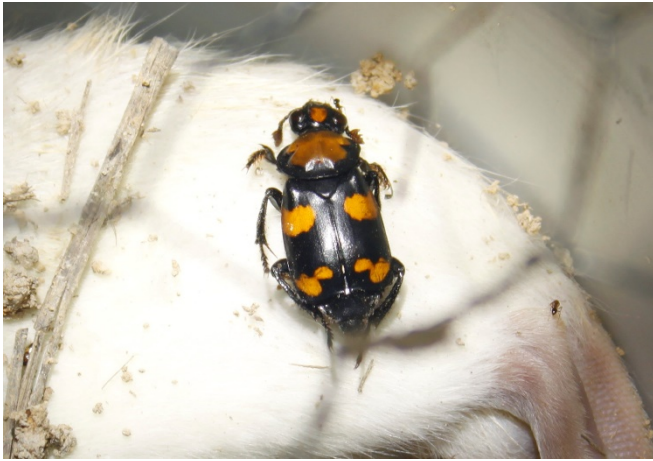
Figure 1. Deceased American Burying Beetle male on rat carrion in a bucket trap in Clark County, AR.

having only one individual to work with so we decided to run a test study with the closely related Nearctic burying beetle, Nicrophorus orbicollis . This study demonstrated that DNA extraction was best achieved using the material near the joints of the legs of the beetle. Our DNA barcoding effort was designed based upon the results of that study (Kelly and Jackson, unpub).