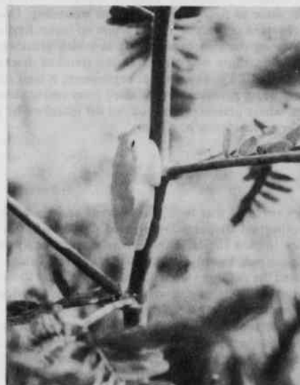
Figure 1. A green treefrog ( Hyla cinerea ) sitting on an anthracnose lesion caused by Collectotrichum gloeosporioides f. sp. aeshynomene on a stem of northern jointvetch in a rice field.

Green treefrogs were observed in rice fields in May when rice was planted. In the middle of the growing season, after the rice flowered and northern jointvetch plants were taller than rice, large numbers of treefrogs were observed. Treefrogs were often observed on the upper parts of northern jointvetch on clear days; however, during the early morning or on windy days, treefrogs were more frequently observed on lower parts of northern jointvetch plants beneath the rice canopy. Treefrogs were frequently observed sitting on anthracnose lesions on northern jointvetch plants above or inside the rice canopy (Fig. 1), especially later in the growing season when disease incidence was high.