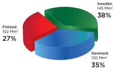
Fig. 2 Size of the current non-residential building stock distributed in between the three Nordic countries: Finland, Sweden and Denmark.

Figure 2 illustrates an overview of the size of the current non-residential building stocks in the three Nordic countries. The area of existing non-residential buildings is estimated to be in total about 377 million m 2 . With the assumption that 1% of the area will be annually renovated based on the Total Concept method, the actual annual volume of renovation will be about 4 million m 2 .