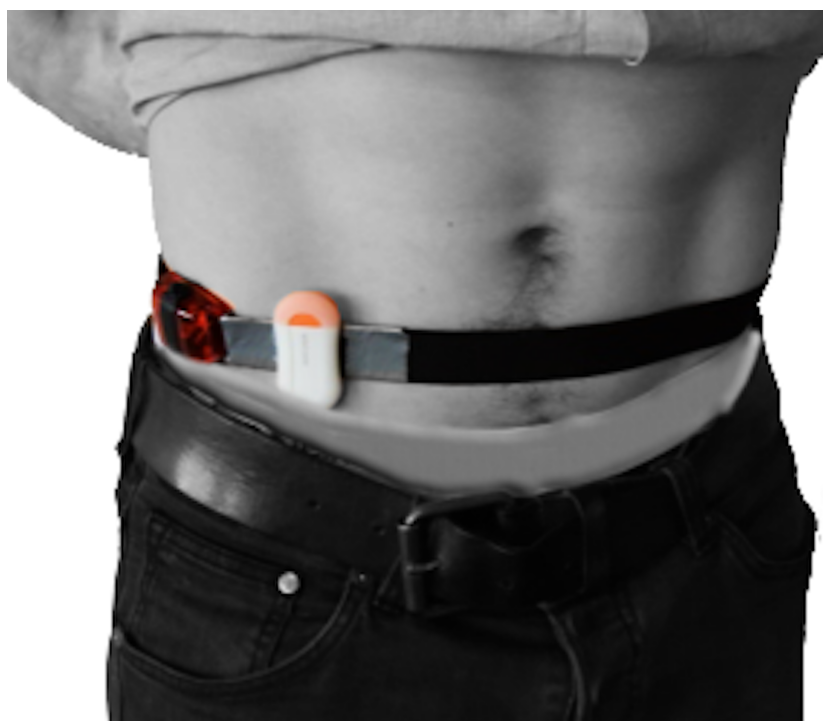
Figure 1 Accelerometer placement. ActiGraph is placed laterally to the right SIAS and the Motion Cookie is placed medially (Randomization 1).