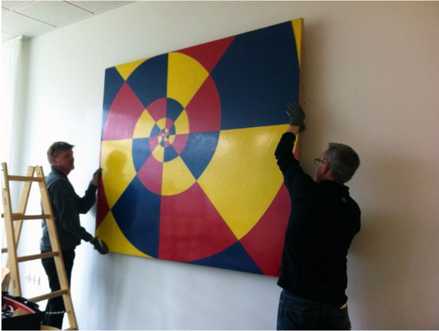
Figure 2. Painting being hung up on back wall in patients' dayroom, week 2 – Case study 1

Case study 2 employed ten posters/reproductions of visual art, of which nine were of an abstract character, in the fourteen single-bed patient rooms for respiratory distress. Interviews of sixty-eight hospitalized patients were collected in the patient rooms over the duration of a month (September 2015). A survey of forty-nine patients and a psychophysiological EEG- and eye-tracking experiment of thirty test participants was carried out to inform qualitative research and reduce bias.