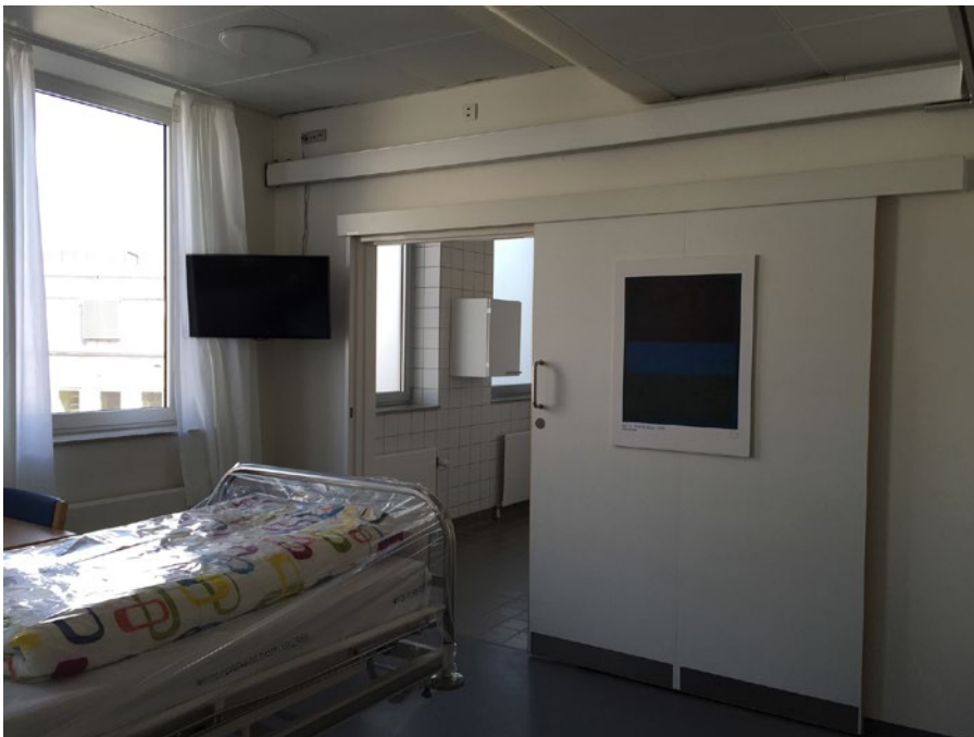
Figure 3. Posters of visual art situated in single-bedded patient rooms – Case study 2

Case study 2 employed ten posters/reproductions of visual art, of which nine were of an abstract character, in the fourteen single-bed patient rooms for respiratory distress. Interviews of sixty-eight hospitalized patients were collected in the patient rooms over the duration of a month (September 2015). A survey of forty-nine patients and a psychophysiological EEG- and eye-tracking experiment of thirty test participants was carried out to inform qualitative research and reduce bias.