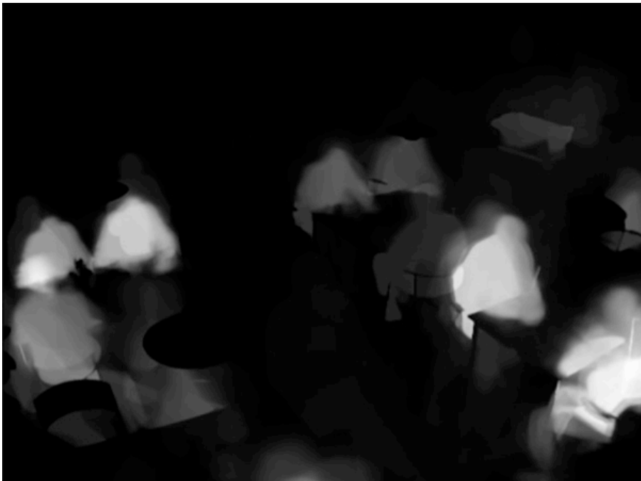
Figure 4: Scaled image of thermal camera recording in dayroom - Case study 1

A psychophysiological experiment was performed in The Augmented Cognition Lab at Aalborg University Copenhagen. The experiment was made up of an EEG and eye-tracking test that monitored brain activity among 30 subjects, divided into 20 men and 10 women with an average age of 24.6 years. Test subjects were presented to the 10 art posters of the main experiment, as well as 40 other works of art on a screen for 40 seconds. The test subjects were then asked to consider the various works. After another 5 seconds, they were presented with a new work (cf. Figure 5).