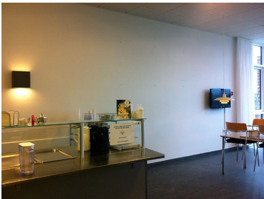
Figure 1. Bare white back wall in patients' dayroom, week 1 – Case study 1

Case study 1 included an initial user-oriented study, which ranked twenty paintings (Nielsen et al., in press). This was followed by an experiment using the four most and the one least popular (ranked) paintings, and which were mainly figurative in nature, in the dayrooms of the five medical wards. Fieldwork was done in the comparative dayrooms, over a two-week period. During the first week, dayrooms were configured without the presence of art; in the second week they were configured with the selected five artworks. Thirty semi-structured interviews were carried out with patients – fifteen each week (cf. Table 1.). Observations, participant observations and informal conversations were carried out in all five dayrooms. Thermal cameras monitored the usage, patient occupation and flow in two of the dayrooms to inform qualitative research and reduce bias.