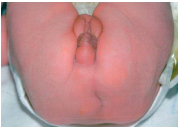
Fig. 2 Case 2 (6-days old), clinical photograph of the patient in the supine position showing an absent anus. Fistula opening is not presented

fistula opening near her vaginal introitus. Her family history was without known inborn abnormalities and consanguinity. Her Apgar scores were 8, 9, and 10 after 1, 5, and 10 minutes respectively. The pregnancy was uneventful. A diverging colostomy was created at 11 days of age. Perioperatively a remnant of vagina was found and the uterus was absent. Normal fallopian tubes and ovaries were demonstrated on both sides. A duplex kidney was found on her right side with hydroureter. A severe sacral dysgenesis was suspected clinically. She had a normal karyotype. PSARP was performed at the age of 4 months. After 6 months the colostomy was closed. A MR scan at 21 months of age revealed a tethered spinal cord and an intradural lipoma from L4 to S2.