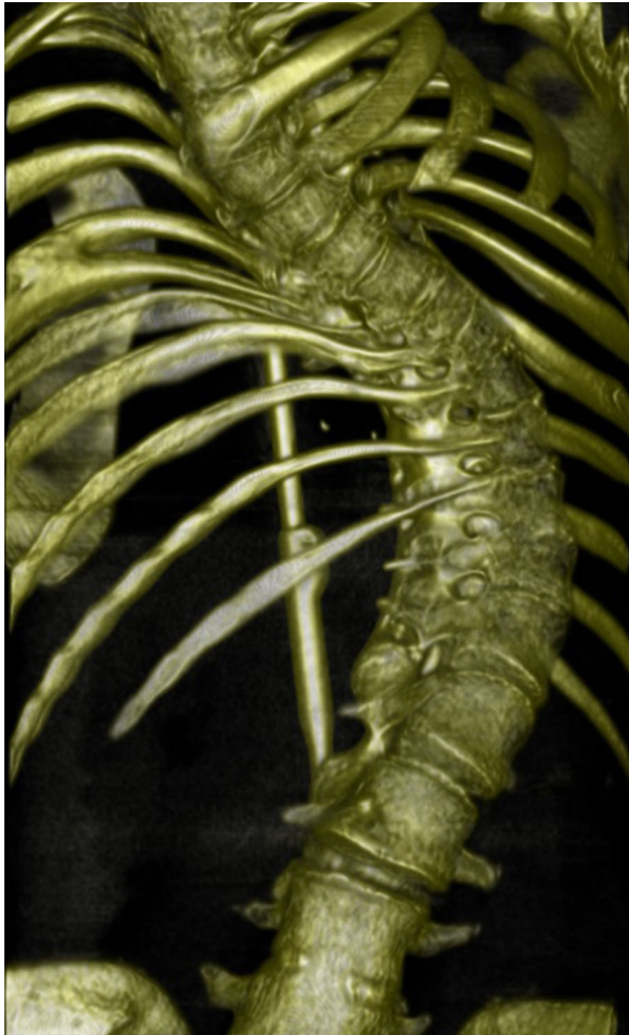
Fig. 1 Case 1, computed tomography reconstruction of the spine showing a thoracolumbar scoliosis