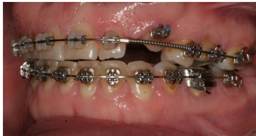
Figure 1. Pre-operative clinical examination. The upper left maxillary canine was partially erupted and infraoccluded compared to the adjacent lateral incisor.

Panoramic and intraoral periapical radiographs of the maxillary upper left canine revealed bony impaction with lack of periodontal ligament. There was no apical pathology and sufficient interradicular space between the adjacent teeth (Figure 2).