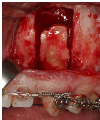
Figure 3. The dentoalveolar segment including the left maxillary canine was mobilized and bonded to the orthodontic arch in the correct dental arch position.

Orthodontic appliance were removed one year after surgery. Clinical and radiographic examination revealed a satisfying esthetic outcome with a neutral canine relation and no radiographic pathology, 18 months after surgery ( Figure 4 and Figure 5 ).