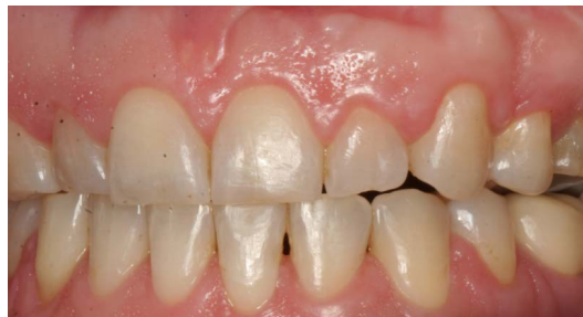
Figure 4. Clinical examination 18 months postoperatively revealed a satisfying esthetic outcome with a neutral canine relation.