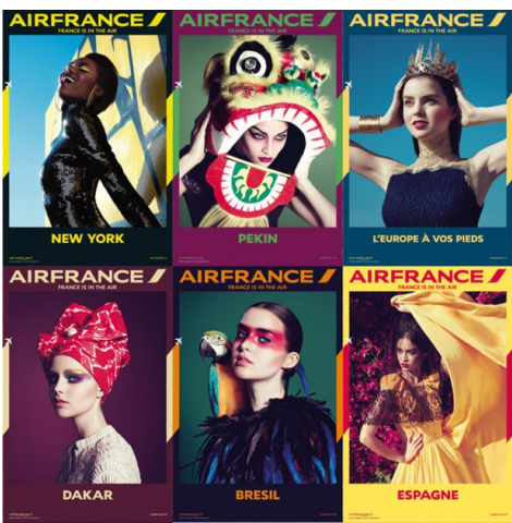
Figure 2: Air France 2014 advertising.

The second example (figure 2) is given by Air France, which launched in 2014 an advertising campaign just like a fashion editorial. Destinations in which it operates were portrayed with elements of the cultural identity of each site, built by the models through a very elaborate styling.