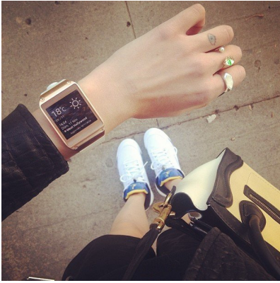
Figure 1: Samsung Galaxy Gear Smartwatch.

The second example (figure 2) is given by Air France, which launched in 2014 an advertising campaign just like a fashion editorial. Destinations in which it operates were portrayed with elements of the cultural identity of each site, built by the models through a very elaborate styling.