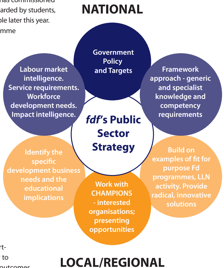
Figure 2 fdf's Public Sector Strategy