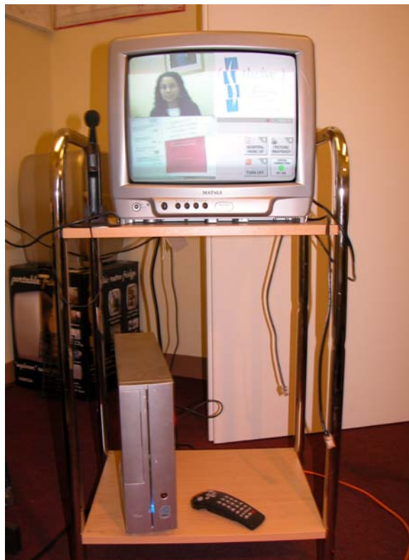
3. Telemedicine console as set up in a patient's home

...showed me what the set-up would be at home, which was fine but with how much that was going on in my head, all I knew is that there would be a camera locked up on my computer and then just follow the instructions to log on and go on to it and that would be it.