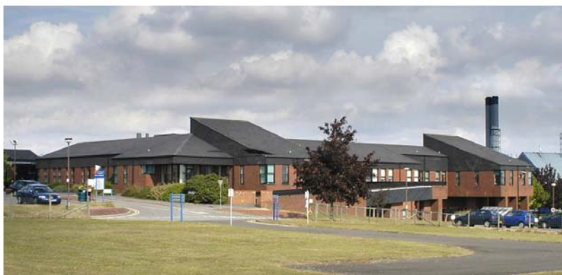
1. The Duke of Cornwall Spinal Treatment Centre, Salisbury Hospital

The Duke of Cornwall Spinal Treatment Centre is situated at the Salisbury District Hospital site near Odstock and benefits from close links with the general departments there. It comprises a purpose-built, 54-bed unit specialising in caring for people who have spinal cord injury, and serves patients in the South and South West of England.