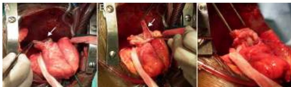
Figure 3 (A) Repair of the pseudoaneurysm (arrow) by the modified Dor procedure; (B) exclusion of the pseudoaneurysm with a Dacron patch (arrowhead) and Teflon strips; (C) final result.