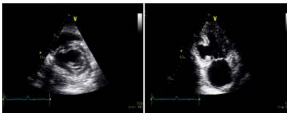
Figure 4 Postoperative control echocardiogram, showing aneurysm of the left ventricular inferior wall, with no continuity with the pericardium.