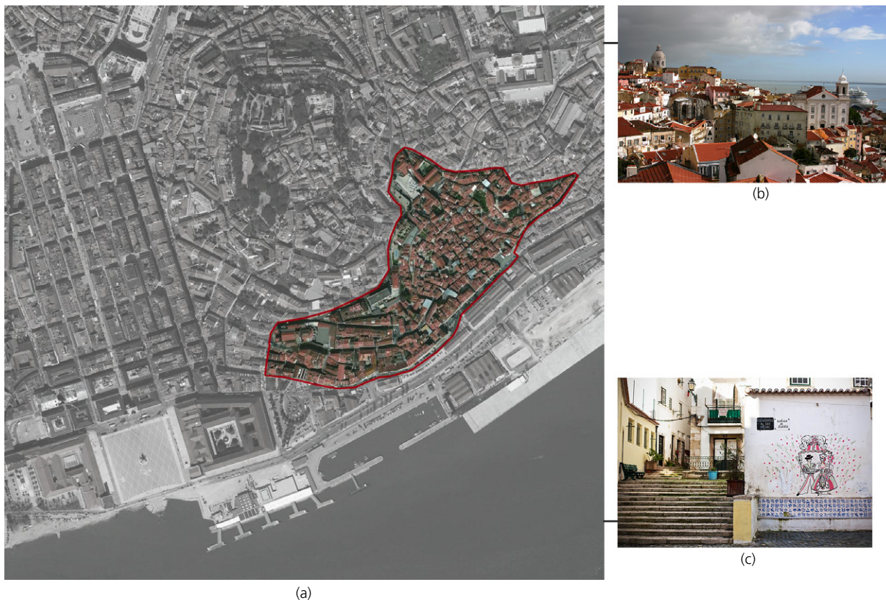
Figure 3. The district of Alfama. (a) Alfama’s neighbourhood, Bing maps, April 2015. Microsoft product screen shot reprinted with permission from Microsoft Corporation. (b) View over Alfama

Offprint provided courtesy of www.icevirtuallibrary.com Author copy for personal use, not for distribution